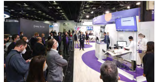
▶ IDS visitors had the opportunity to watch a number of live demonstrations at the exocad booth.