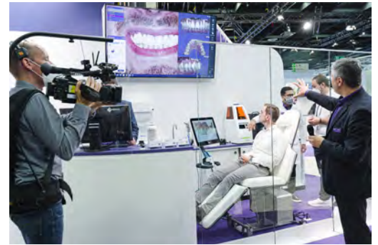
▶ For dental professional, who were unable to attend IDS in person, exocad offered live streamings during the show.

The joint platform with exocad DentalCAD, the world's leading CAD laboratory software, also unlocks unimagined possibilities for digital collaboration with tens of thousands of laboratories. More information can be found at https://exocad.com/ids . ◀