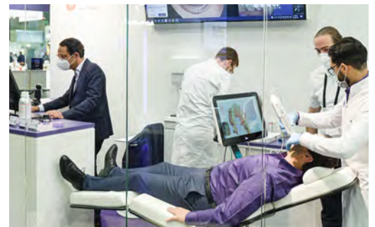
▶ At this year's IDS, exocad announced the release of ChairsideCAD 3.0 Galway, the next generation of its easy-to-use CAD software for single-visit dentistry.