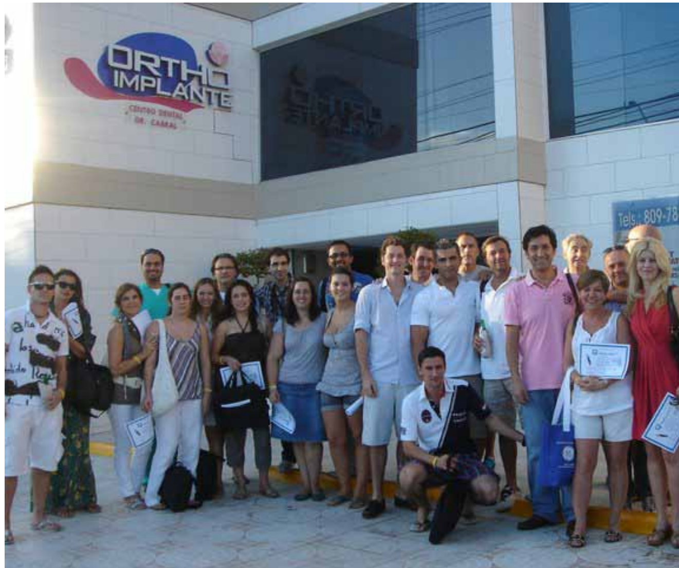
The Q-Implant Marathon team with participants in Santo Domingo.

This gives dental practitioners an opportunity to learn the relevant practical