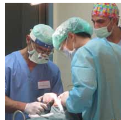
Q-Implant Marathon participants in Santo Domingo working in a team.

The atmosphere is harmonious: even after 12 hours in the surgery room, the groups still like to meet for an evening