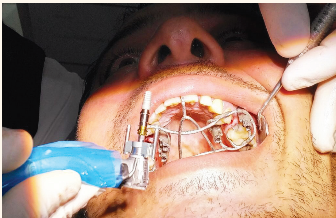
The open design of the guide gives great visibility and allows cooling

Our primary product line remains PFM crowns and bridges. However, since we last met, we have introduced two new products: Removable Partial Dentures and Metal Surgical Guides. The RPDs which we produce are a great solution for a partially edentulous patient who is not a candidate clinically or financially for implants. We use a metallurgical process called Solution Annealing which brings flexibility into our metal and helps with the fit for the patient. The second product is a metal 3D printed Surgical Guide. This is a really exciting innovation in Surgical Guides and we recently collaborated on a trial surgery to test the product in the Middle East region for the first time.