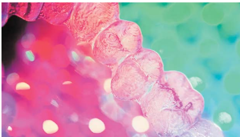
Several research projects in Scandinavia have focused on improving the oral health of adolescent patients.