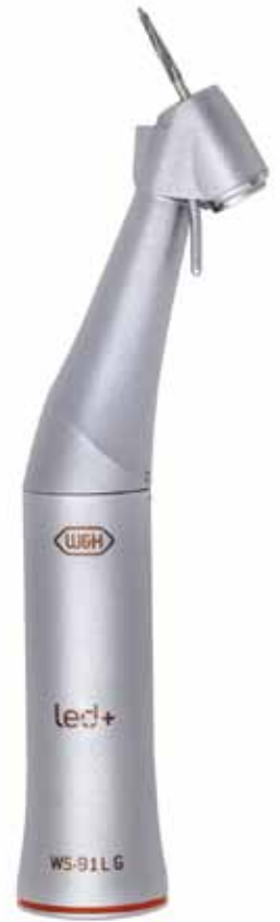
The new surgical contra-angle handpiece WS-91LG.