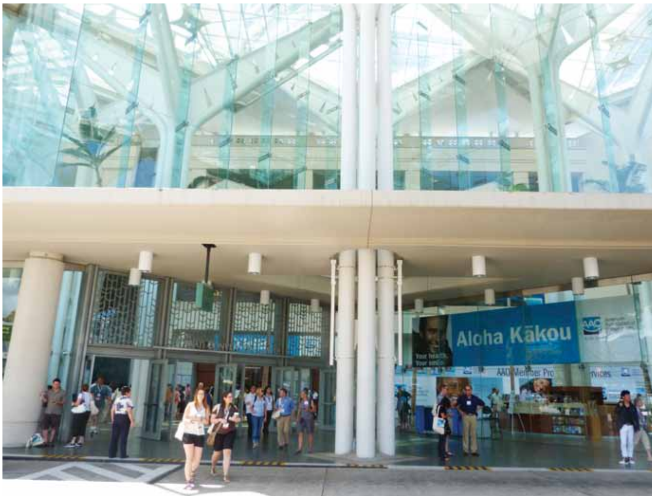
The Hawaiian Convention Center will host the AAOMS 96th Annual Meeting from Sept. 8–13.