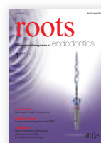
Cover image courtesy of FKG Dentaire ( www.fkg.ch )