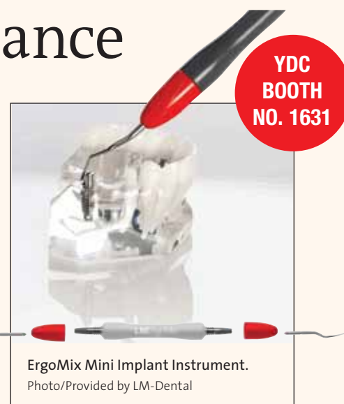
ErgoMix Mini Implant Instrument.

The implant series includes four instrument patterns: Mini Gracey 1/2 – anterior (gray); Mini Gracey 11/12 – mesial (orange); Mini Gracey 13/14 – distal (blue); and Mini Universal – universal, all surfaces (red). They are available as a kit, containing one of each instrument and a cassette, or they may be purchased individually.