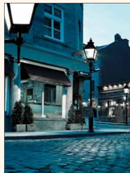
Saint-Paul Street in Old Montréal is one of many sights awaiting attendees of the 2015 Journées Dentaires Internationales du Québec, May 22–26.

The exhibition hall will feature more than 225 companies in 500 booths in the 133,563-square-foot space.