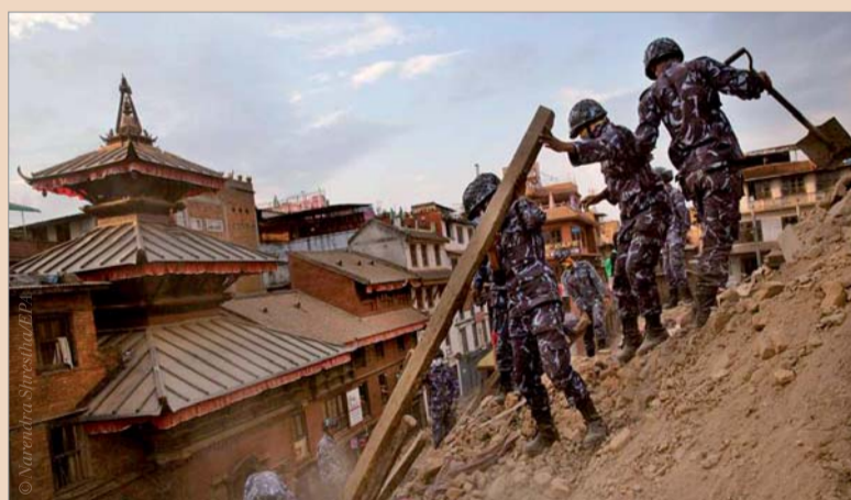
Photo shows clearing work in Kathmandu. The capital of Nepal was among the regions hit by the country's worst earthquake in over 80 years. ASIA NEWS , Page 2

During a follow-up period of five years, 25 (4.4 per cent) participants died. The researchers observed that individuals with 20 teeth or more had a significantly lower mortality rate (2.5 per cent) compared with those with 19 teeth or fewer (6.1 per cent). Overall, the data indicated that there was a 4 per cent point increase in the five-year survival rate per additional tooth retained at the age of 70, the researchers reported. DTI