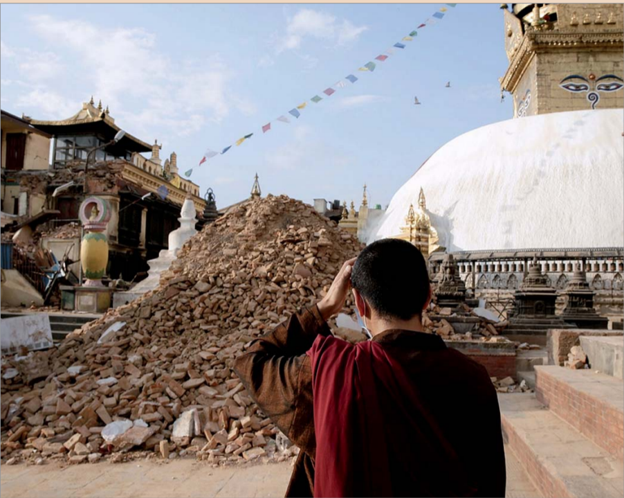
Monk looking at destruction caused by the 25 April earthquake in the Nepalese capital Kathmandu. Damages are estimated at US$200 million.