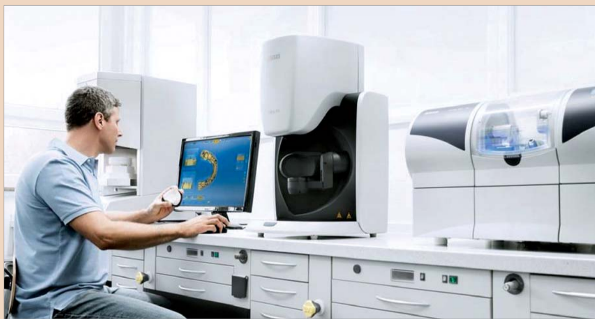
A dental technician using Sirona's inLab system.

"We are seeing less investment in CAD/CAM systems in many Asia-Pacific countries due to preference for porcelain-fused-to-metal, as opposed to all-ceramic restorations. Dental laboratories increasingly prefer standalone scanner systems as a more affordable option than higher-priced milling systems," explained iData