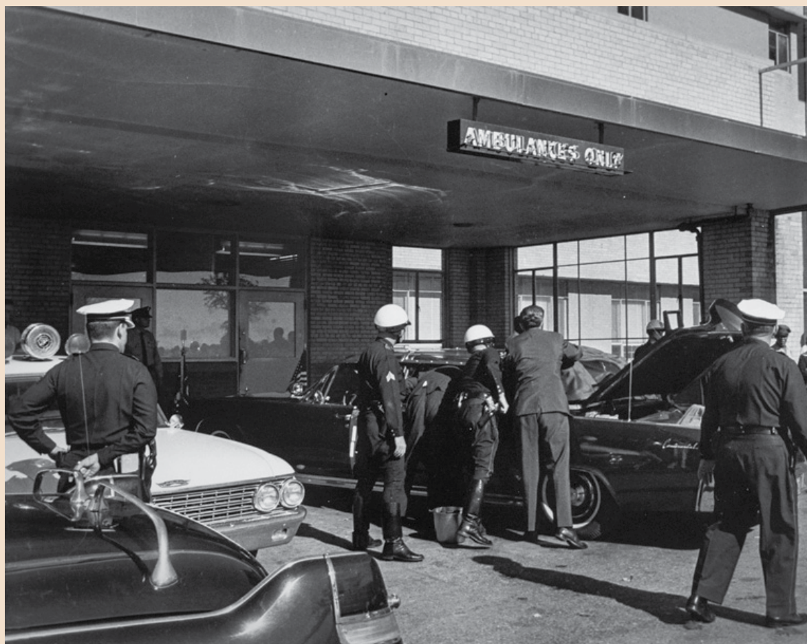
US Secret Service agents and local police examine the presidential limousine outside of Parkland Memorial Hospital in Dallas, as President John F. Kennedy is treated inside

DTI: A feature film about the events at Parkland Memorial Hospital, produced by Tom Hanks and starring Billy Bob Thornton, has just been released on the 50th anniversary of the Kennedy assassination. Have you seen it, and does it stay true to the events, in your opinion?