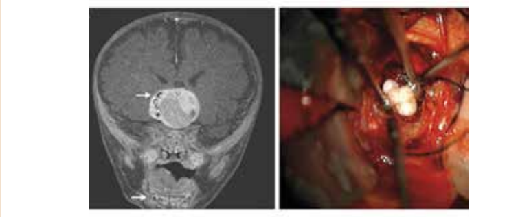
Teeth were found in the tumour mass

Multiple fully formed teeth have been found inside a tumour mass that was growing in the brain of a four-month-old child. The boy was initially admitted to a clinic in Baltimore after a routine paediatric visit due to an increasing head circumference. The doctors also found structures near the mass similar to those of teeth in the mandible. Upon surgical removal of the tumour, the surgeons found a number of teeth inside the mass, which was identified as an adamantinomatous craniopharyngioma. Such tumours arise from Rathke's pouch, an embryonic precursor to the anterior pituitary, and consist of stratified squamous epithelium and wet keratin, and may be cystic.