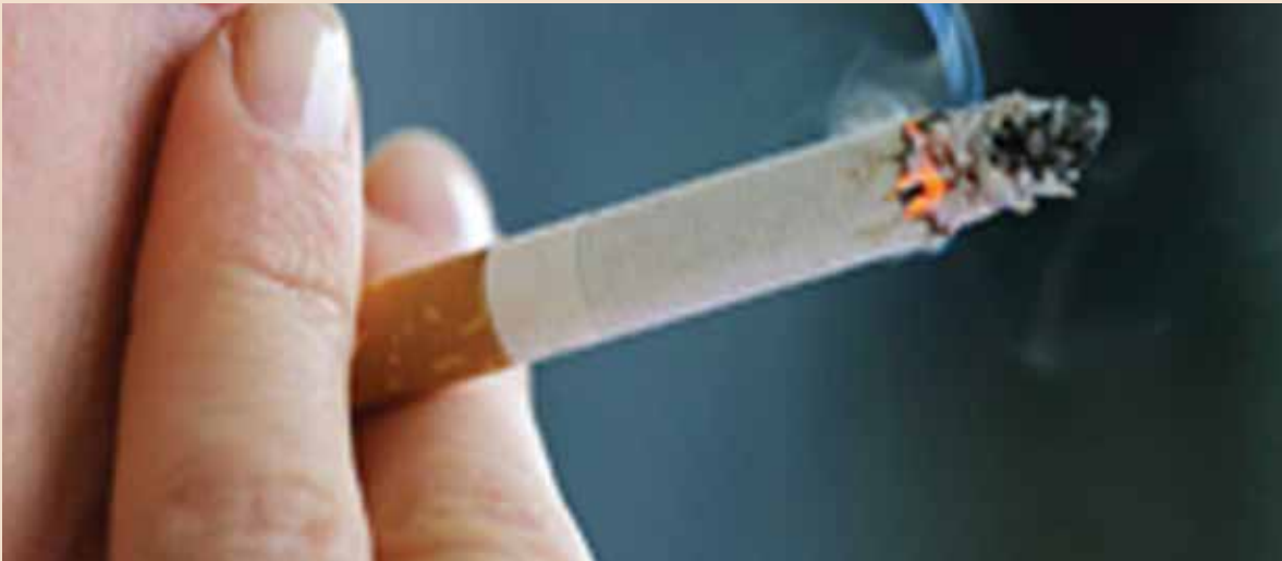
Smoking should butt out of films, say campaigners