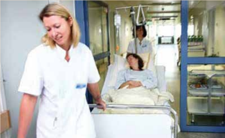
25,000 people were admitted to hospital for tooth removal last year

The NHS could save at least £4 million every year on hospital admissions for the removal of rotten teeth if water fluoridation were extended to areas with high levels of tooth decay, according to research published in the British Dental Journal . Analysis by the researchers of hospital statistics over a three-year period suggests that on average, 6,900 young people were admitted annually for dental extractions in the largely non-fluoridated North West. In the same period, that figure was just 1,100 in the West Midlands which is largely fluoridated. Using data from 2008-9, the cost of carrying out a dental extraction under general anaesthetic was £558 or £789 depending on the complexity of the procedure, bringing the total cost of the operations to around £4 million in the North West. Professor Damien Walmsley,