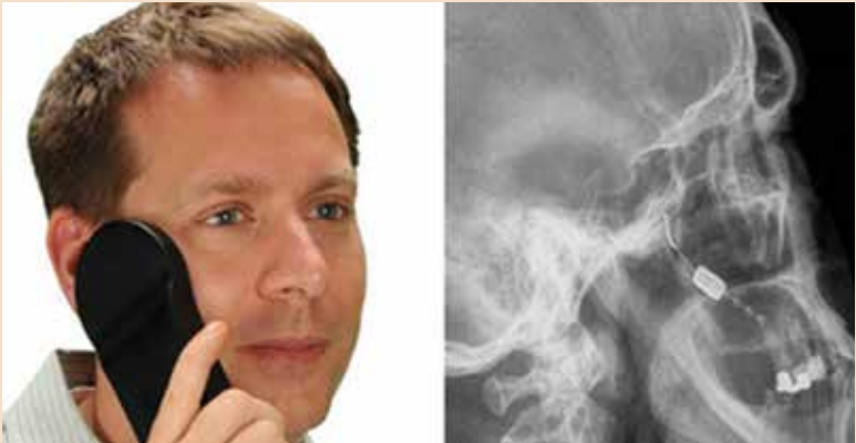
A remote control is used to begin the therapy

A new mini-implant has been developed to help those affected by cluster headaches. Cluster headache is one of the most severe forms of headache. It is usually unilateral and occurs mostly around the eye or in the temple, and attacks can last up to several hours. The ATI Neurostimulation System includes a novel, miniaturised device that is implanted using oral surgery, leaving no externally visible scars. When the patient feels a cluster attack beginning, they hold a remote controller up to their cheek to begin the neurostimulation therapy. A new clinical study published