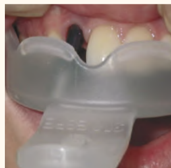
Fig. 3: The 3M Directed Flow Impression Tray has been chosen for its strength and handling characteristics. Note the palatal reservoir.