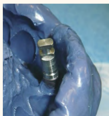
Fig. 14: Place an implant lab analog into impression coping and secure with the screw. The impression is now ready to be sent to the dental laboratory for pour up and crown fabrication. Note the incredible detail and accuracy seen in the 3M Impregum Soft Polyether Impression Material.