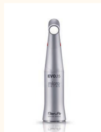
Bien-Air EVO.15 1:5 L (back)