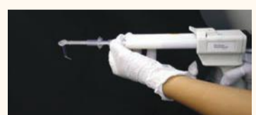
Fig. 7: The 3M Intra-oral Syringe is loaded from the hand-held gun but not yet activated.