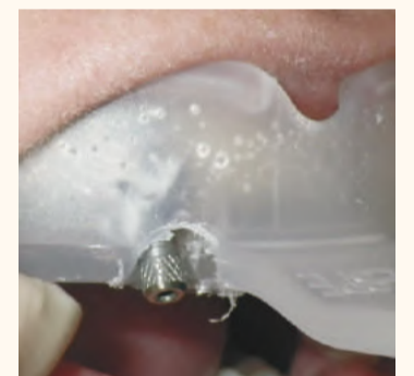
Fig. 5: The 3M Directed Flow Impression Tray is being tried in the mouth to make sure that the impression screw is accessible.