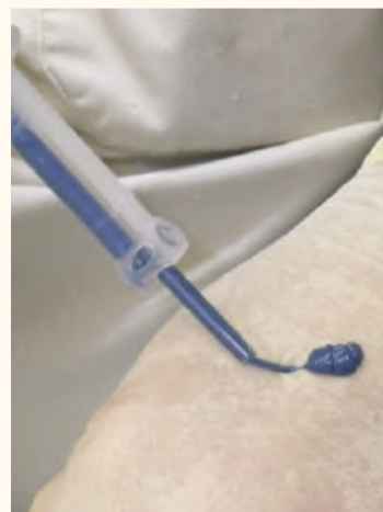
Fig. 9: The 3M Intra-oral Syringe is activated and must be bled before using for final impression.