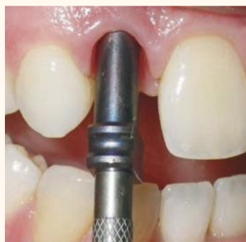
Fig. 2: A pickup impression coping has been secured to the implant. Note the central screw which extends out of the implant impression sleeve.