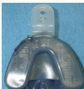
Fig. 13: The impression has been removed from the mouth and is ready for inspection.