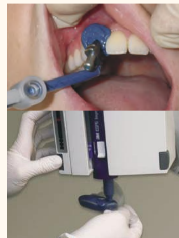
Fig. 10: Inject impression material around the impression coping while the dental assistant is loading the 3M Directed Flow Impression Tray using the 3M Pentamix 3 Automatic Mixing Unit.