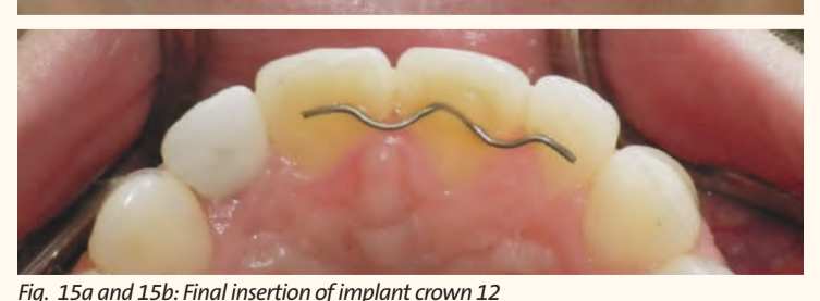
Fig. 15a and 15b: Final insertion of implant crown 12