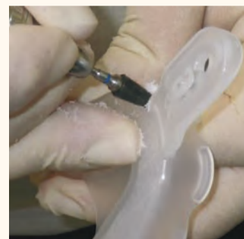
Fig. 4: An acrylic bur is being used to cut a hole in the tray to access the impression screw.