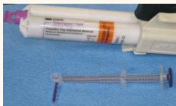
Fig. 6: A 3M Intra-oral Syringe is ready to be loaded with 3M Impregum Soft Polyether Impression Material.