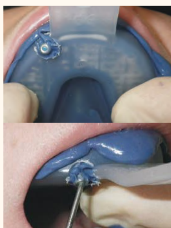
Fig. 12: Once the 3M Impregum Soft Polyether Impression Material has set, use an implant driver to unscrew the impression screw. Remove the 3M Directed Flow Impression Tray.