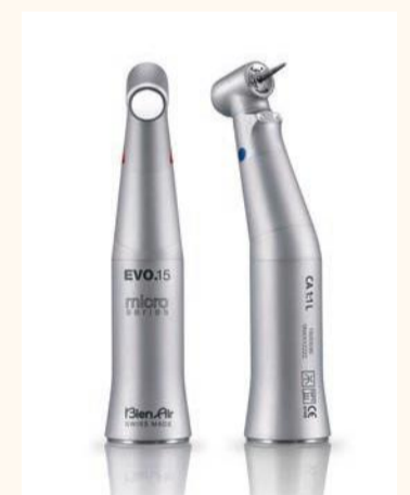
Bien-Air EVO.15 1:5 L (back) + EVO.15 1:1 L (left)