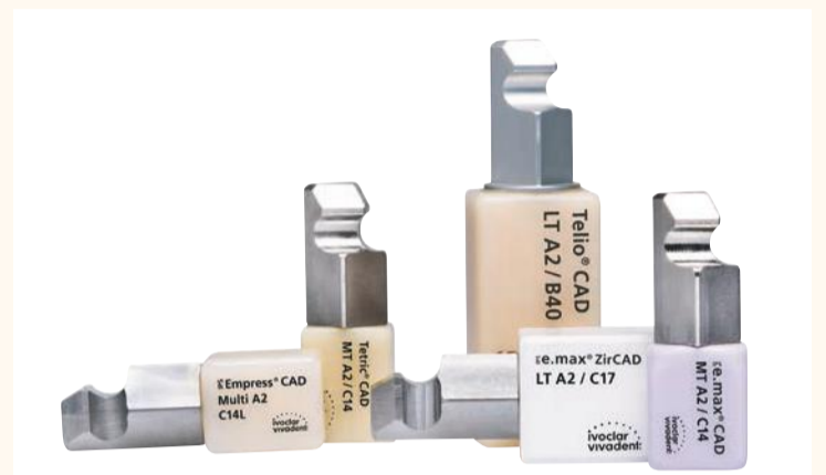
Dentists using PlanMill can now benefit from an even larger range of Ivoclar Vivadent materials to produce their restorations

IPS e.max, Tetric, Telio, Programat, SpeedCEM and OptraGate are registered trademarks of Ivoclar Vivadent AG.