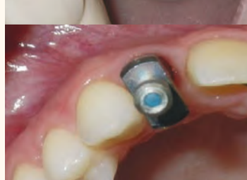
Fig. 8: Wax is placed on the impression screw to obturate the driver receptacle.