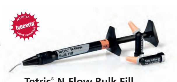
Tetric® N-Flow Bulk Fill flowable