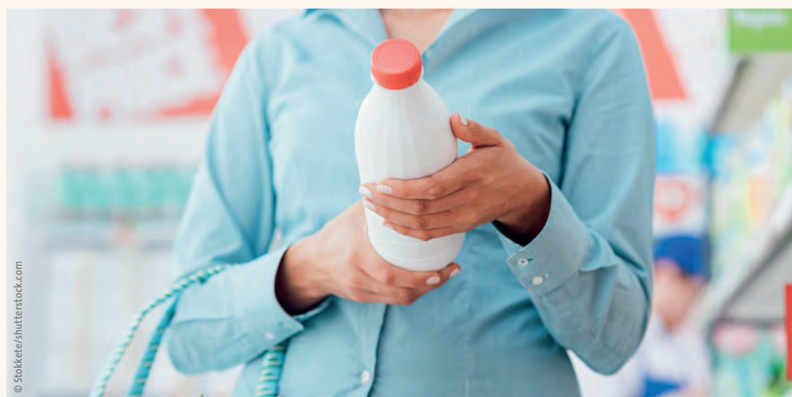
Seven out of ten packaged goods sold in supermarkets contain added sugar, the study found.

The Health Star Rating front-of-pack labelling system used in Australia rates the overall nutritional profile of packaged foods and includes total sugar content as one of the components. This has been criticised because sugars naturally present in some foods are treated the same as sugars added during processing. However, according to co-author of the study Prof. Bruce Neal, only labelling total sugar content is misleading. This is particularly true for discretionary products containing a great deal of added sugar. "Good sugars are an