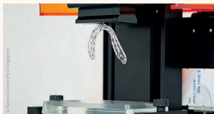
A surgical guide for oral maxillofacial surgery created by a device that uses UV light to cure photosensitive resins into 3-D structures.