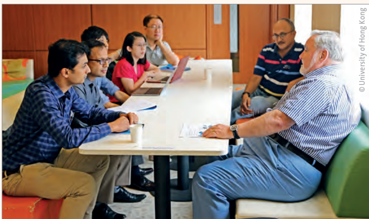
The four-day course held in Hong Kong offered intensive education on good scientific practice and research methodology.