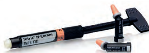
Tetric® N-Ceram Bulk Fill sculptable

* Compared with Tetric® N-Flow and Tetric® N-Ceram Data available on request.