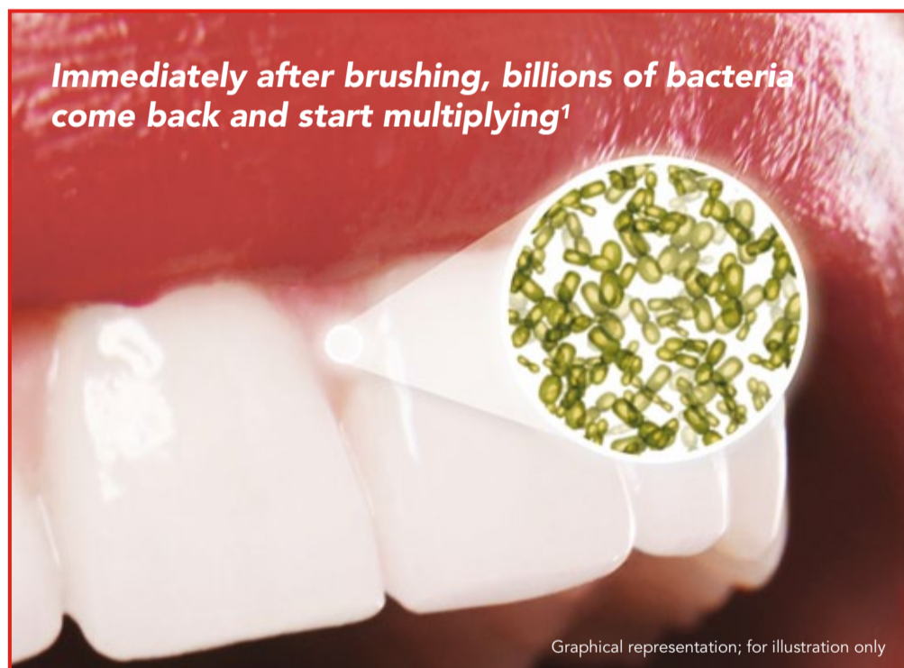
Graphical representation; for illustration only

Clinically proven 12-hour antibacterial protection