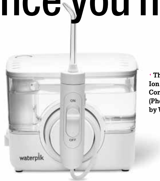
• The Waterpik Ion Professional Cordless Model.

higher settings, research has shown that even on the highest pressure settings, the Waterpik Water Flosser is safe on the gingival tissue and epithelial attachment.