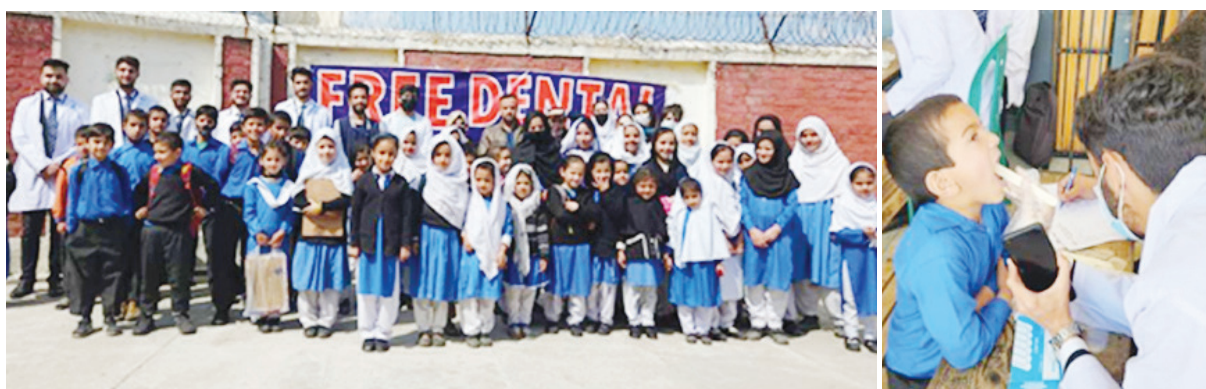
The AIMI Department of Preventive & Community Dentistry Team! Here's a snapshot of team alongside school children. On the right, a child who underwent oral examinations and received personalised treatment.

ABBOTTABAD: The Abbottabad International Medical Institute (AIMI) Department of Preventive & Community Dentistry teams, in collaboration with Colgate, visited a total of 17 schools in Abbottabad, where they conducted a comprehensive oral examination of 10,550 children, providing their personal treatment plans and a free treatment card, as part of its community outreach programme for 2023.