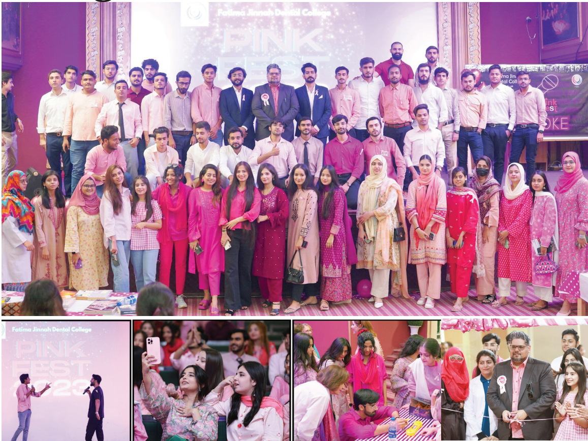
Photos capture the moments of unity and support at the inaugural festival ceremony, celebrating breast cancer survivors. The event featured a distinguished panel of healthcare professionals and educators sharing valuable insights with the audience.

KARACHI: The city recently witnessed a vibrant spectacle as the annual Pink Fest opened at the pre-clinical campus of Fatima Jinnah Dental College, adorned in various shades of pink, becoming a focal point of 'Pinktober' — Breast Cancer Awareness Month.