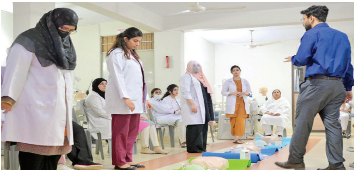
Participants engaged in a Basic Life Support (BLS) workshop.