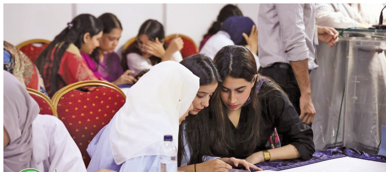
Participants engaged in a quiz competition at DentalNovate 2024.

AIDM also presented a series of engaging posters featuring