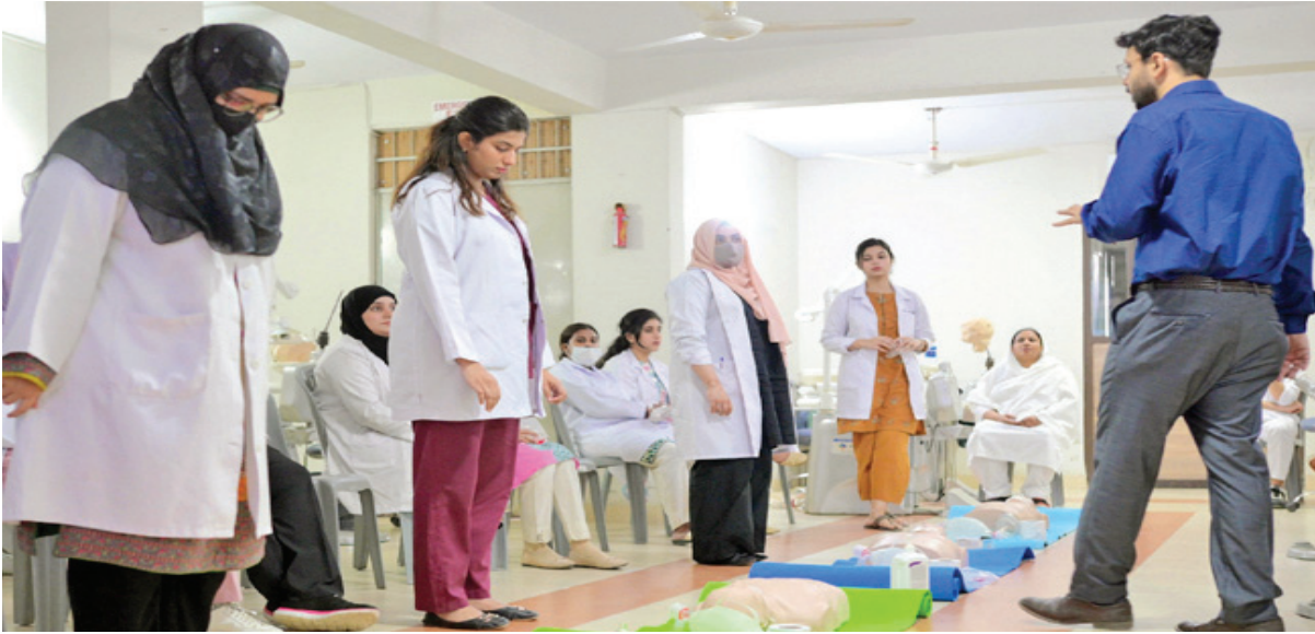
Participants engaged in a Basic Life Support (BLS) workshop.