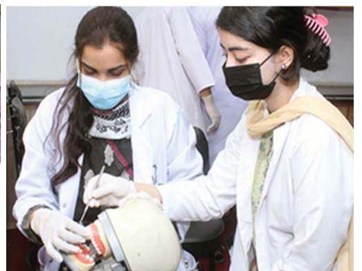
Participants engaged in a hands-on fluoride varnish application workshop, perfecting their dental care skills.