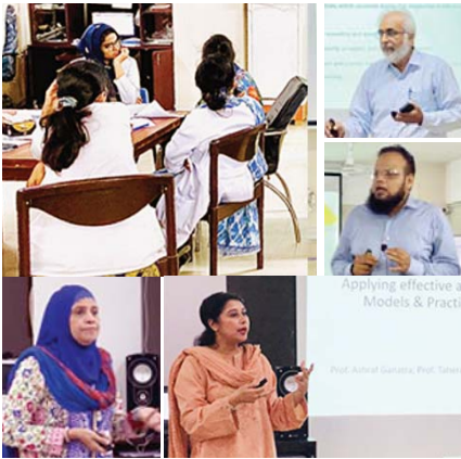
Workshops on 'Residents as Educators,' in progress.