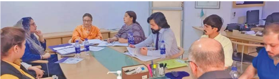
A productive session with the AIDM and JSMU academic teams, deep in discussion about the six-month Certificate of Health Professions Education (CHPE).

KARACHI: The Altamsh Institute of Dental Medicine (AIDM) has launched its groundbreaking Certificate of Health Professions Education (CHPE) course that has Jinnah Sindh Medical University affiliation.