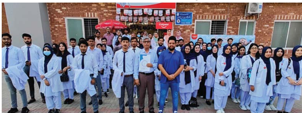
Celebrating Oral Health Week with the dedicated team of dental healthcare providers at Niazi Dental Hospital!

SARGODHA: Niazi Dental College (NDC) and Colgate Pakistan recently joined hands to mark an Oral Health Week, featuring a range of activities, including a free dental camp at the Niazi Dental Hospital and checkups at local schools.