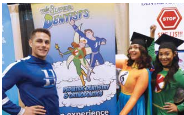
• Check out the Howard Healthcare Academy at booth No. 2260, which is the only dental assistant program in California that partners with The Super Dentists to bring students a hands-on experience.