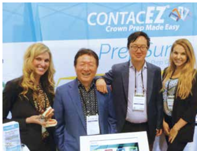
• The team at ContacEZ is ready to answer all your questions at booth No. 2142.