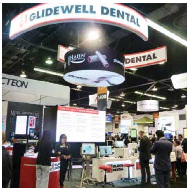
• There is a lot to see at the Glidewell Dental booth, No. 1452.