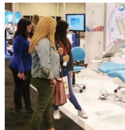
• CDA attendees check out the Planmeca Romexis at booth No. 1376.