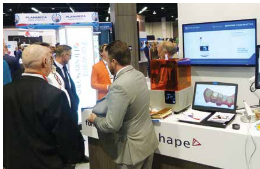
• A crowd gathers at the Henry Schein booth, No. 1362, during 3-D printing demonstrations featuring 3Shape Trios and Formlabs Form2 3D Printer.

Henry Schein (booth Nos. 1362, 1562, 1568 and 1662) is widely known for its Henry Schein Cares support of community dental services and other charitable causes across the globe. It consistently provides the Berkeley