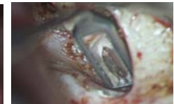
Optimal visibility of the isthmus