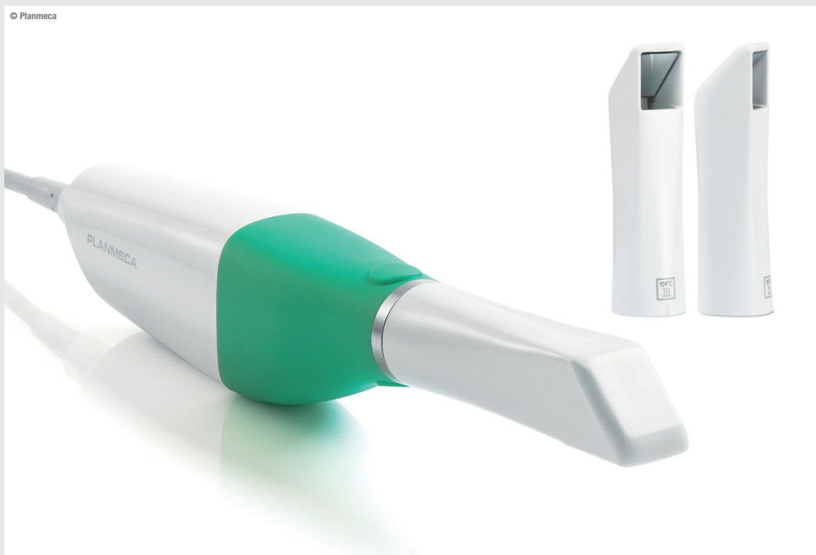
*Owing to its small size and light weight, the Planmeca Emerald scanner is very convenient to use.

Planmeca Emerald's seamless, autoclavable and exchangeable tips make infection control measures simple and efficient. The scanner's two buttons also allow it to be operated without touching a mouse or keyboard, and it can even be controlled from a foot pedal when connected to a dental unit. The scanner's plug-and-play capability allows it to be effortlessly shared between different rooms and laptops. In addition to its standard tip, Planmeca Emerald now has an even smaller and thinner tip available. The new SlimLine tip is ideal for scanning patients with smaller mouths and makes