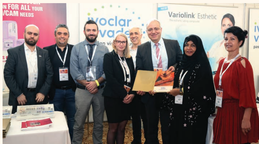
Ivoclar Vivadent was once again Crystal Sponsor during the 9th DFCIC