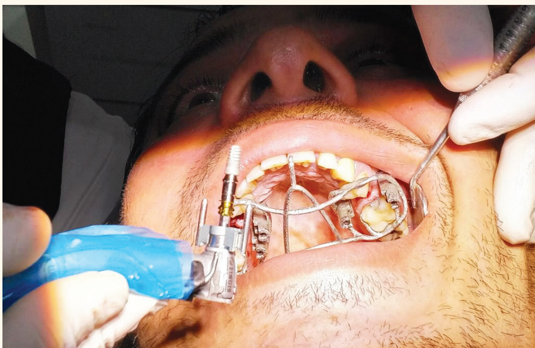
The open design of the guide gives great visibility and allows cooling

Our primary product line remains PFM crowns and bridges. However, since we last met, we have introduced two new products: Removable Partial Dentures and Metal Surgical Guides. The RPDs which we produce are a great solution for a partially edentulous patient who is not a candidate clinically or financially for implants. We use a metallurgical process called Solution Annealing which brings flexibility into our metal and helps with the fit for the patient. The second product is a metal 3D printed Surgical Guide. This is a really exciting innovation in Surgical Guides and we recently collaborated on a trial surgery to test the product in the Middle East region for the first time.