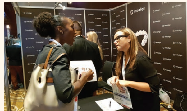
Gold Sponsor Invisalign was once again present this year