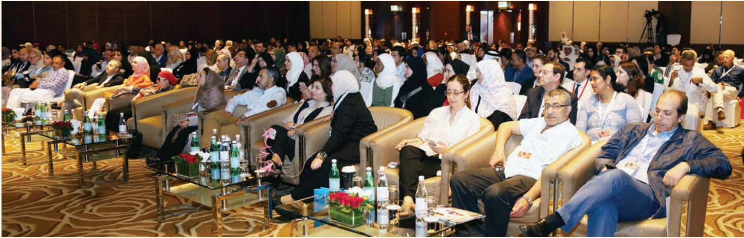
Over 3000 delegates attended the two day event 9th Dental Facial Cosmetic Conference & Exhibition