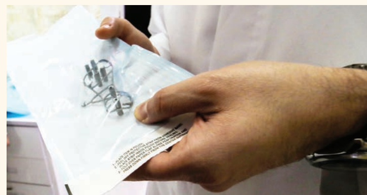
The metal 3D printed surgical guide which is sterilised before use