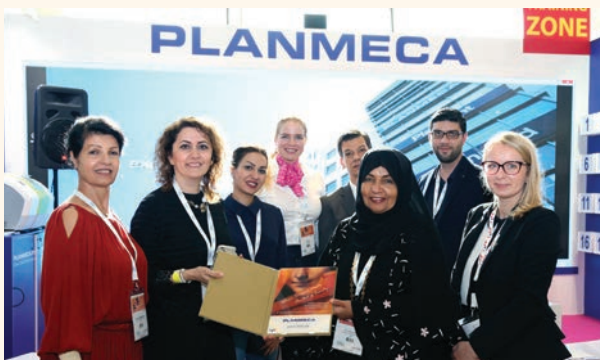
Gold Sponsor Planmeca presented their dream clinic at the exhibition