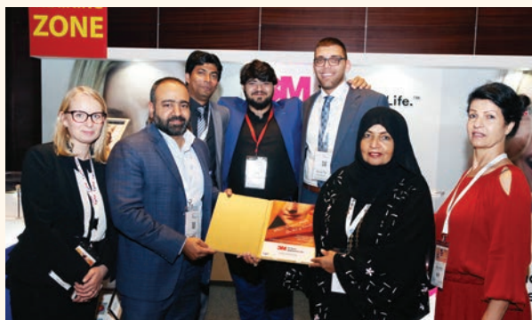
Gold Sponsor 3M received several dozens of delegates at their dedicated training zone at the booth