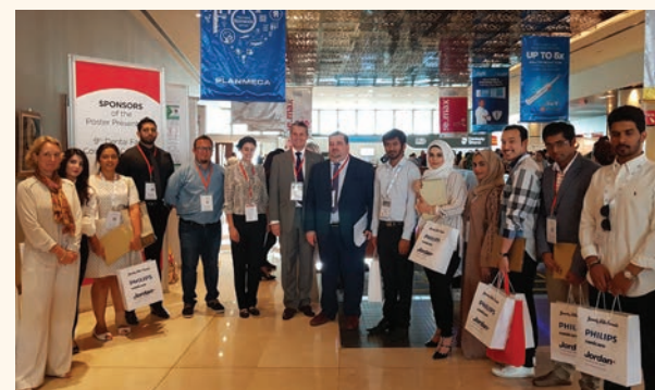
Poster Presentations at the 9th Dental Facial Cosmetic Conference