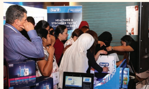
Gold Sponsor Oral-B held multiple Free CME trainings at its dedicated training zone