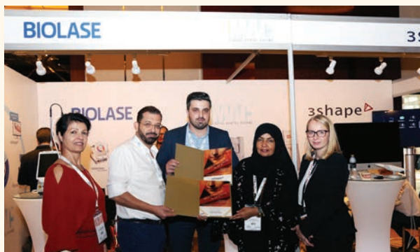
Gold Sponsor MAC Digital & 3Shape