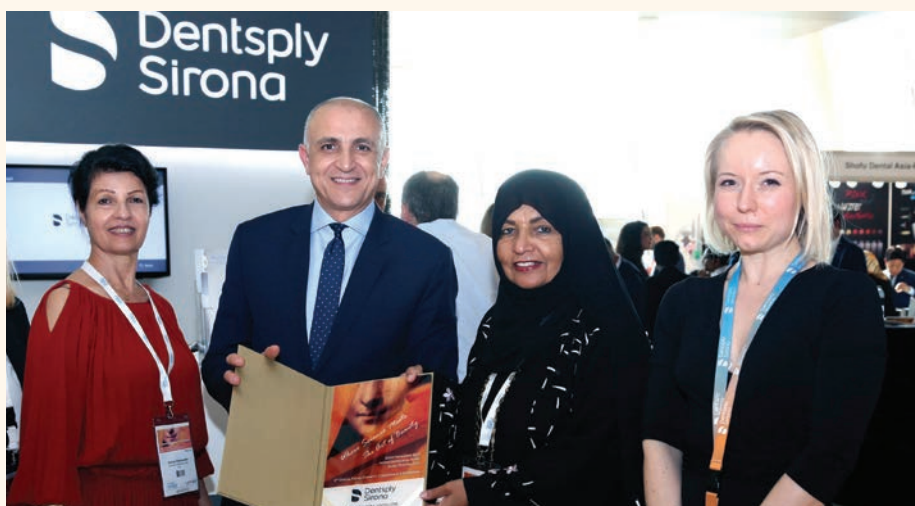
Platinum Sponsor Dentsply Sirona received appreciation for the continuous support