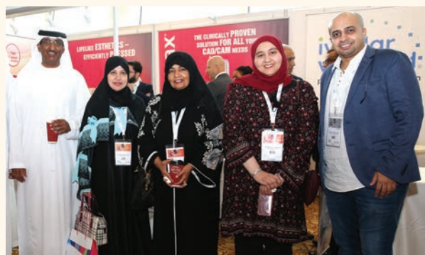
Delegates from Ministry of Health and Emirates Dental Society