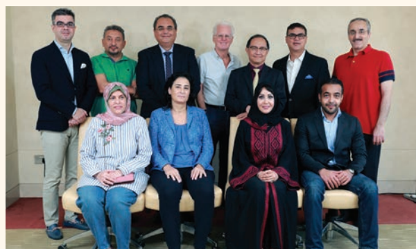
Dental Toothpaste Consensus 2017

"Thank you again for inviting me to this great meeting, it was a real honor to be part of this well organised event."