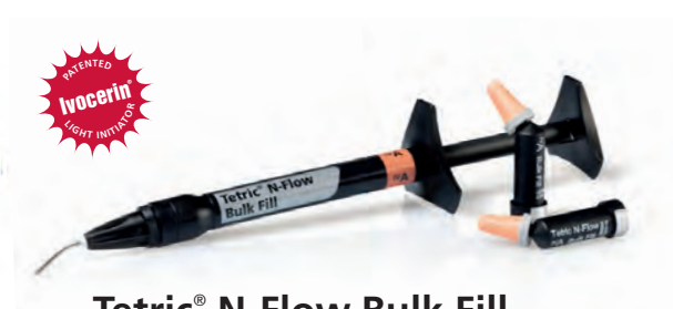
Tetric® N-Flow Bulk Fill flowable