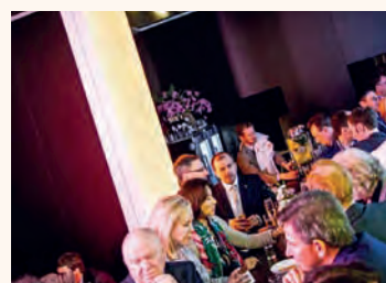
Action shot from the Channel3 right held at the OEMUS MEDIA/Dental Tribune International booth.