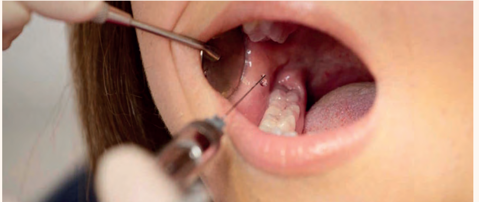
Unlike nerve block anaesthesia, the key to provide successful dental local anaesthesia is intraosseous anaesthesia, which allows the anaesthetic to reach any nerves, no matter where they branched off.

The main problem with failing anaesthesia lies with the dental curriculum, because dental schools do not allocate enough time, lectures and practical sessions to the subject. Often, the topic is interwoven within different subjects and it is assumed that students assimilate the information and will apply it successfully in the clinic. Infiltration anaesthesia, mandibular nerve block anaesthesia and intra-ligamentary anaesthesia are probably taught in every dental school as the "mainstream" techniques. However, what one should do in case of failure probably depends more on who is involved in teaching the course. A plethora of solutions are taught in dental school by different clinical teachers, ranging from combining amides and combining techniques to increasing the dosage or to injecting intraosseously. By the way, why is a carpule 1.7 or 2.2 millilitres in volume, irrespective if