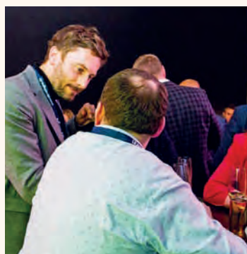
Attendees at the Channel3 right held at the OEMUS MEDIA/Dental Tribune International booth.