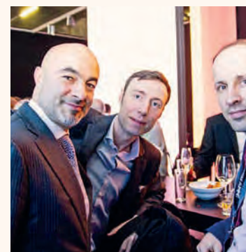
Dental Tribune International CEO Torsten Oemus with attendees from the Channel3 booth party.