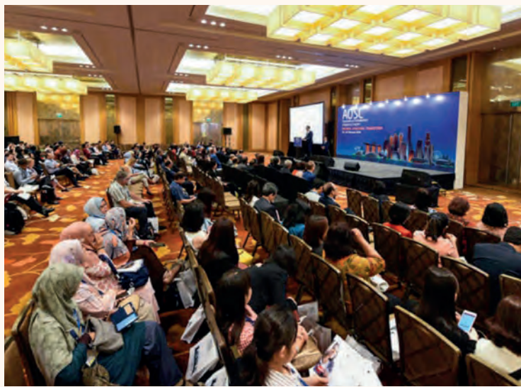
At this year's AOSC, there was a 20 per cent increase in attendees, with more than 60 per cent coming from overseas.

SINGAPORE: Recently the Association of Orthodontists (Singapore) Congress (AOSC), organised by the Association of Orthodontists (Singapore), took place at the Marina Bay Sands hotel in Singapore. With an abundance of relevant information and an increase in attendees over the previous year, organisers of the event believe it reaffirms the show's position as the must-attend orthodontic event in the Asia Pacific region.