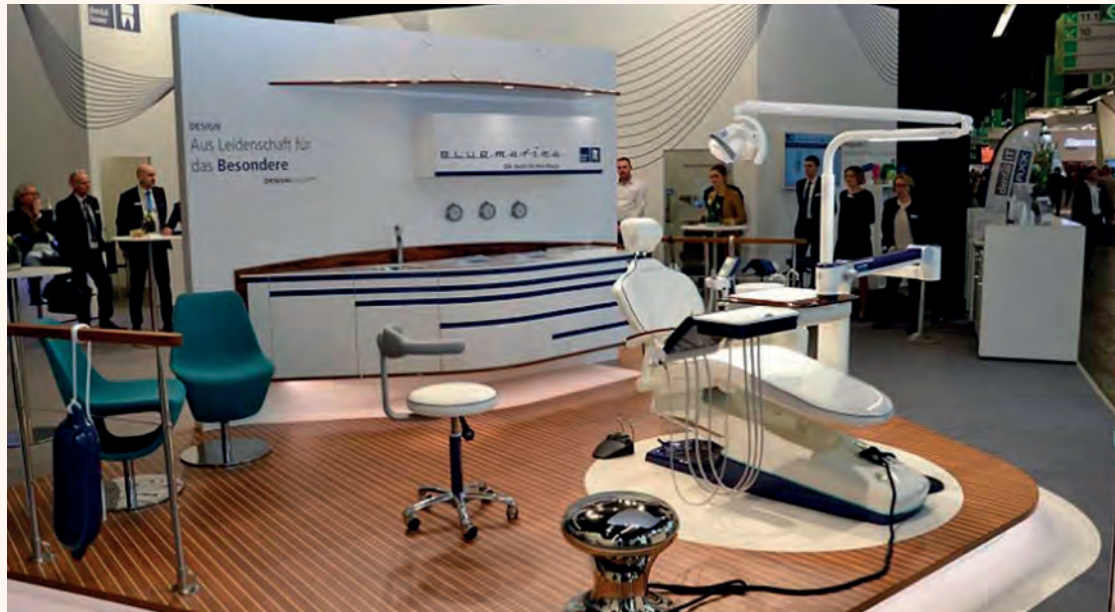
The exclusive "blumarina" dental line is aimed at those who appreciate sharing the experience of the aesthetics of individual design with their patients and would like to distinguish their practices.

The treatment unit inspires with its detail-rich, timeless elegance in combination with state-of-the-art modern technology. The ergonomic shape, the comfortable soft padding with its aesthetic stitching