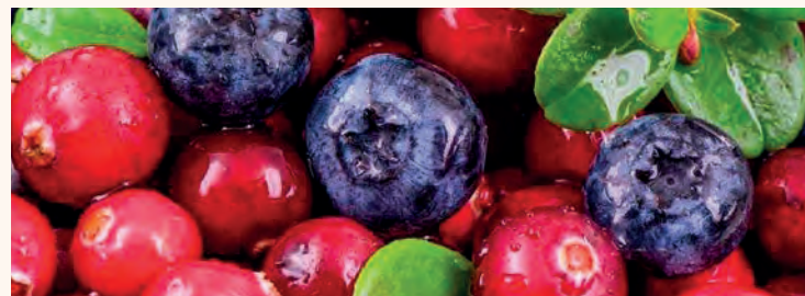
Phytonutrient-rich cranberries and blueberries may help inhibit biofilm according to a new study.

Continued research goes into fruit extracts for oral health care and bacteria management.