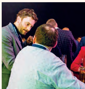
Attendees at the Channel3 right held at the OEMUS MEDIA/Dental Tribune International booth.