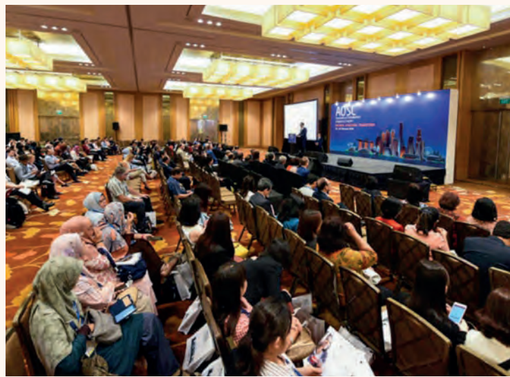
At this year's AOSC, there was a 20 per cent increase in attendees, with more than 60 per cent coming from overseas.

SINGAPORE: Recently the Association of Orthodontists (Singapore) Congress (AOSC), organised by the Association of Orthodontists (Singapore), took place at the Marina Bay Sands hotel in Singapore. With an abundance of relevant information and an increase in attendees over the previous year, organisers of the event believe it reaffirms the show's position as the must-attend orthodontic event in the Asia Pacific region.