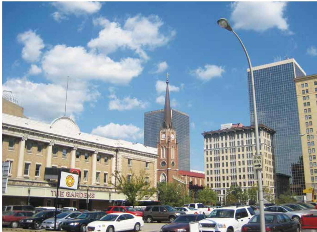
Louisville is the largest city in Kentucky. It was founded in 1778 by George Rogers Clark and is named after King Louis XVI of France, making Louisville one of the oldest cities west of the Appalachian Mountains. This year it is also the host city of ADHA22.