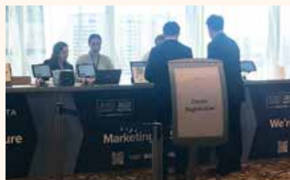
Attendees register during the 2022 ADSO Summit, held in Austin, Texas.

lenges, the ADSO recently launched a Workforce Task Force comprised of ADSO member companies and dental industry partners. The task force will investigate issues impacting recruitment and retention and provide recommendations to help dental practices meet their staffing needs.