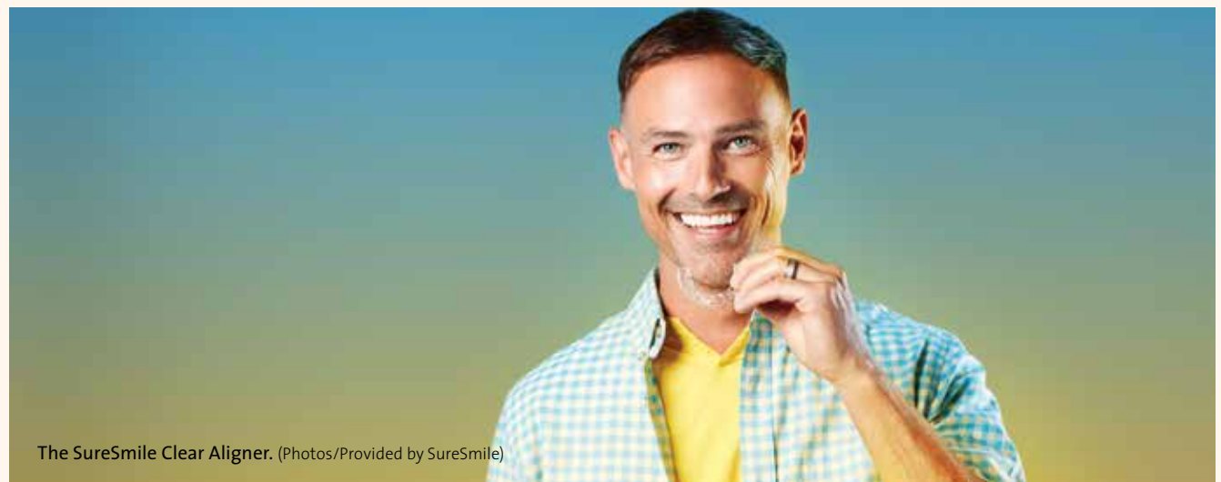
The SureSmile Clear Aligner.

It may be time for providers to realign their expectations for clear aligner treatment and discover that a better experi-