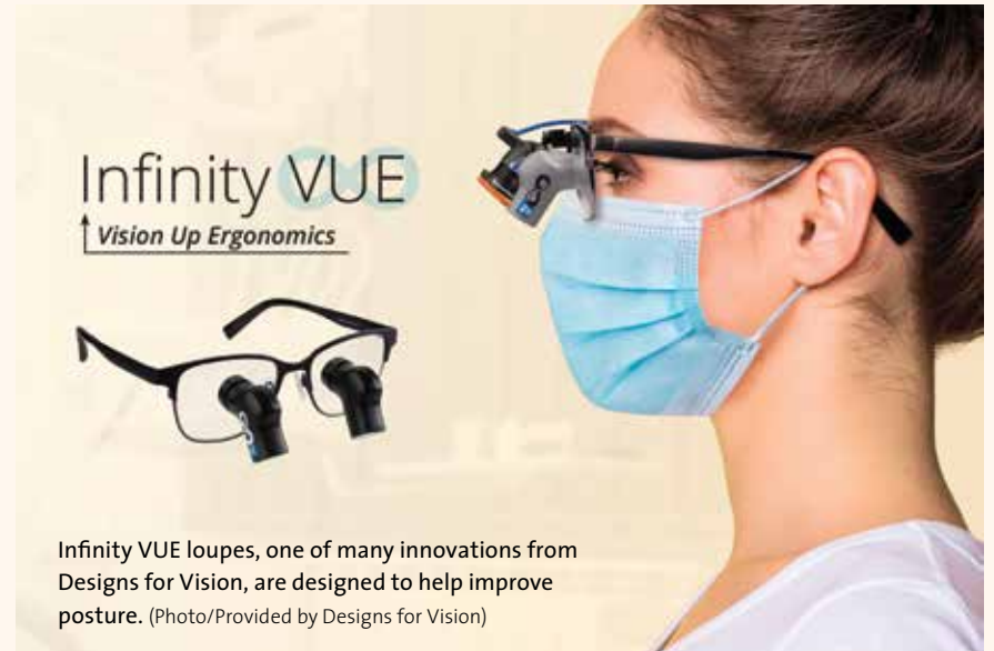
Infinity VUE loupes, one of many innovations from Designs for Vision, are designed to help improve posture.

Designs for Vision is also introducing patented (US pat. 8,851,709 & RE46,463) hands-free infrared technology with the WireLess IR HDi and the Micro IR HDi headlights. The patented IR feature allows you to operate the headlight