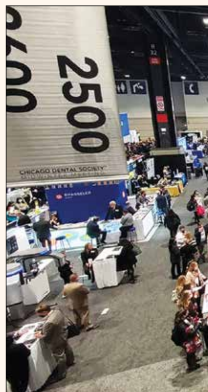
Attendees stroll through the Chicago Midwinter Meeting exhibit hall during the 2022 show. This year, the meeting is being held Thursday, Feb. 23 to Saturday, Feb. 25.