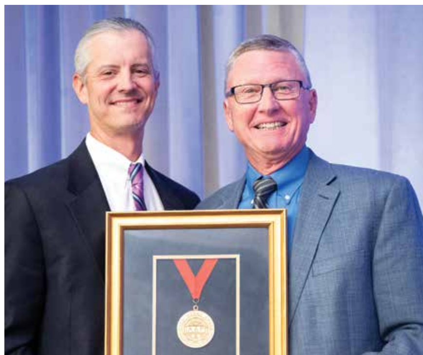
AAP award recipients are celebrated at a ceremony during the AAP's 108th annual meeting in Phoenix.