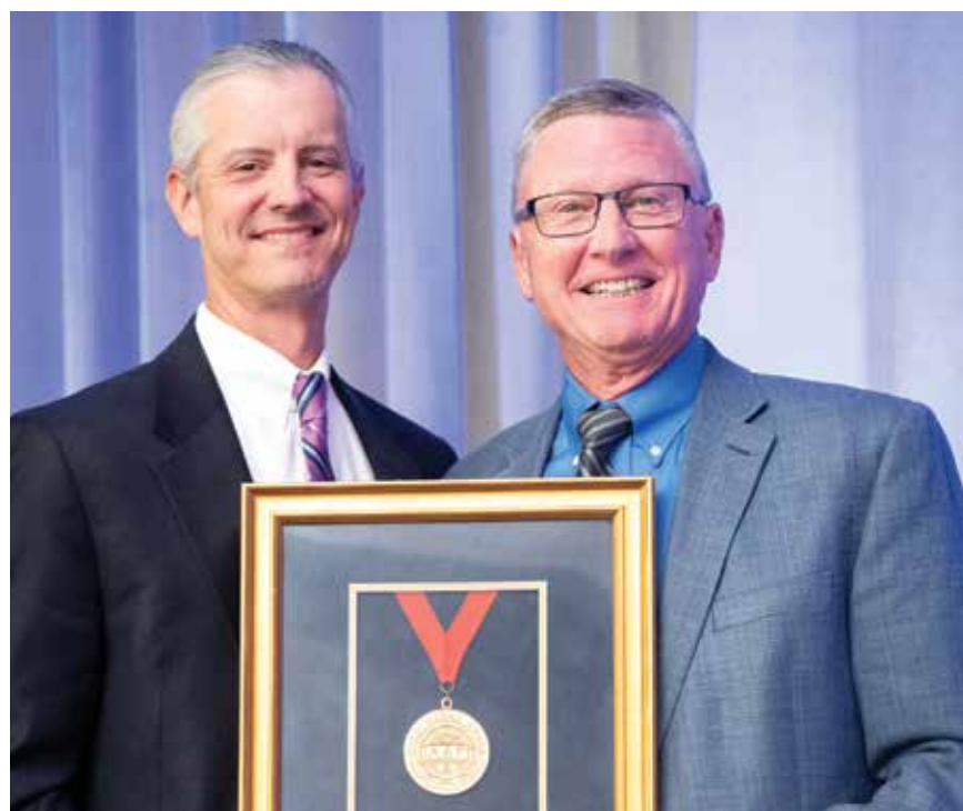
AAP award recipients are celebrated at a ceremony during the AAP's 108th annual meeting in Phoenix.