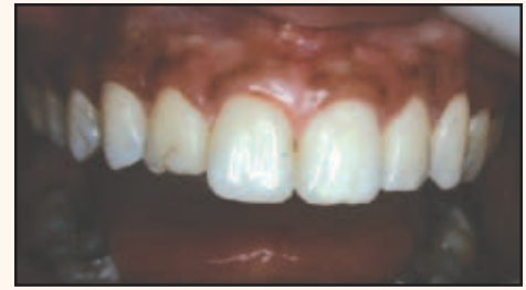
Fig. 1: Before, patient wanted a nicer smile.