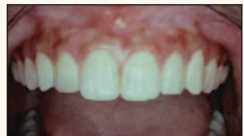
Fig. 3: Healed periodontia. Enamel exposure full and natural. Tooth #7 restored.