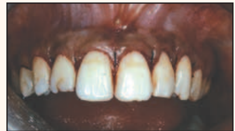
Fig. 2: Periodontal tissue repositioned sutured with sling suture technique.