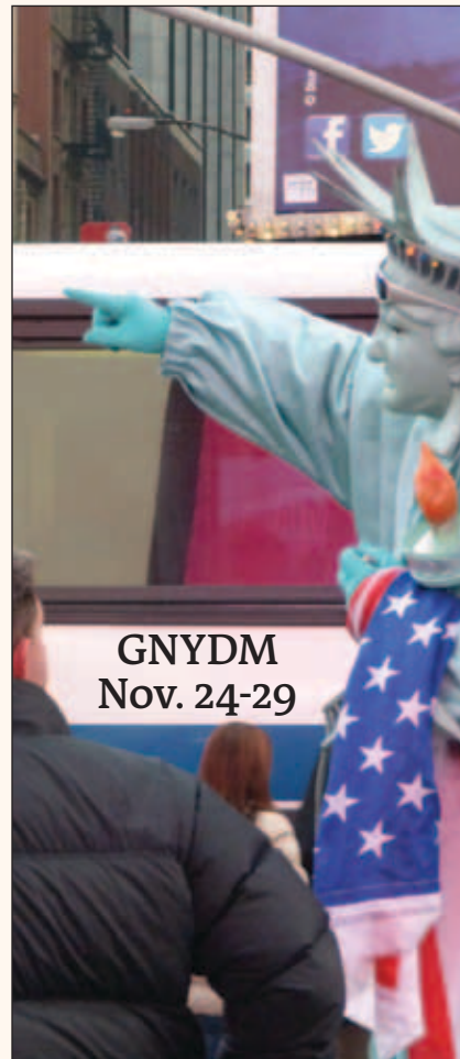
The Statue of Liberty, on break in Times Square, points the way to the Jacob K. Javits Convention Center, host site of the 2017 Greater New York Dental Meeting.

(Source: Greater New York Dental Meeting)