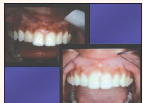
Fig. 4: Patient loves and is motivated to care for her new, bright, symmetrical smile.