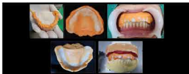
Figures 9-11. The final impression, vertical dimension, and occlusal relationship were acquired at once without the wax rim stage by using a duplicate denture.