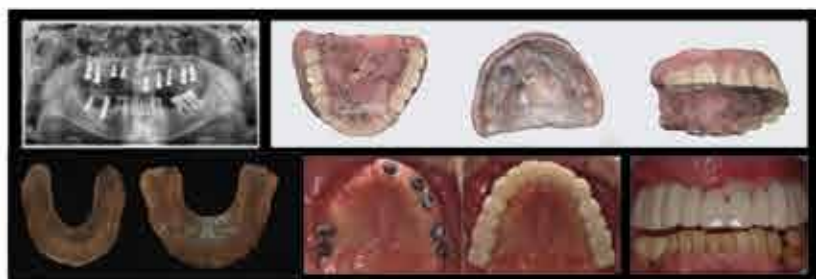
Figures 2-6. Duplicate denture created using the Medit i700 to scan the temporary complete denture used after maxillary implant placement. This duplicate denture was used to mount the maxillary and mandibular models. This reduced the number of visits required for wax rim production and acquisition of information of the jaw relationship. Customized abutment and PMMA temporary prosthesis can be immediately created and fitted.

The maxillary and mandibular models can be mounted in the laboratory using such duplicate denture, reducing the number of visits and chair time for the patient.