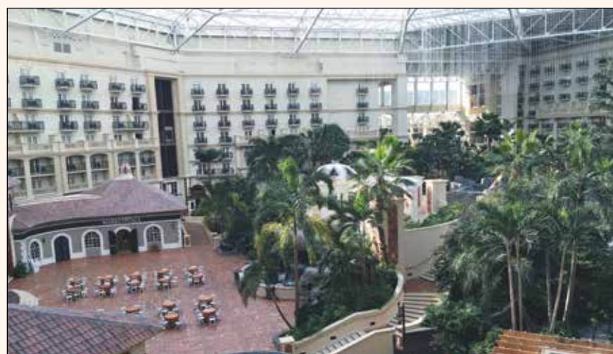
The atrium of the Gaylord Palms Resort & Convention Center in Orlando, which is the site of this year's Florida Dental Convention, running from June 23 to June 25.