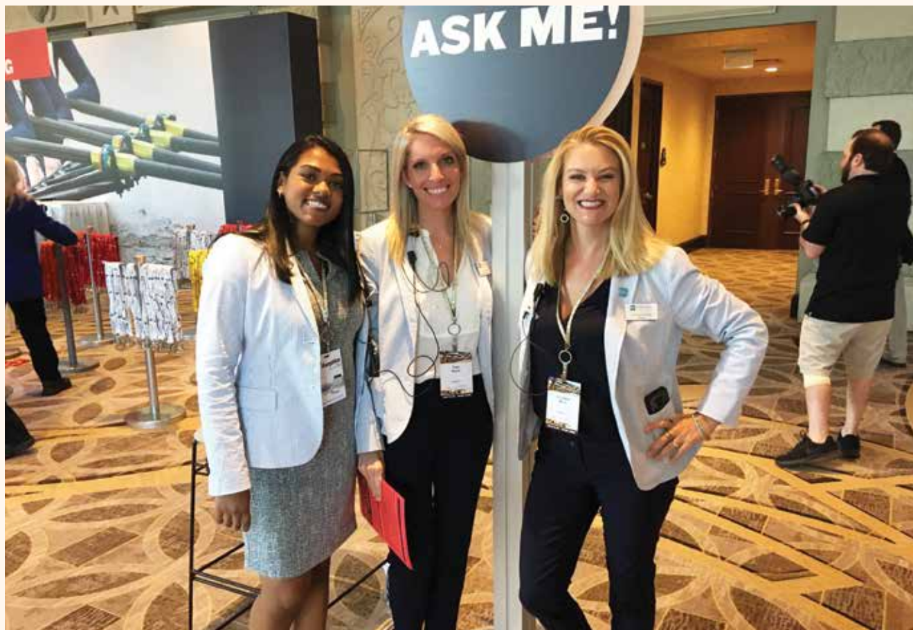
It's all smiles at a past year's Florida Dental Convention. This year's meeting features cutting-edge education, social events and a packed exhibit hall.