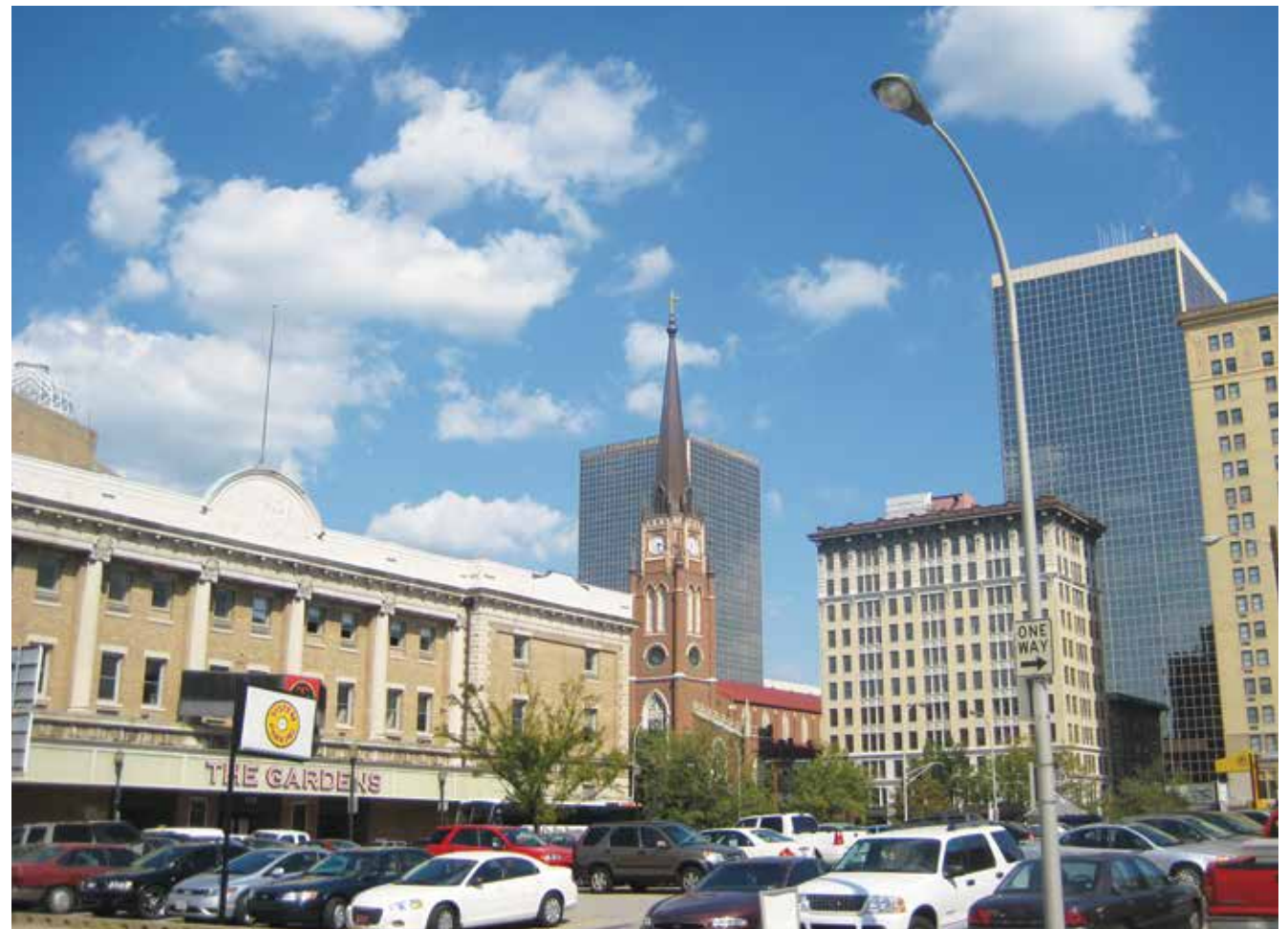
Louisville is the largest city in Kentucky. It was founded in 1778 by George Rogers Clark and is named after King Louis XVI of France, making Louisville one of the oldest cities west of the Appalachian Mountains. This year it is also the host city of ADHA22.