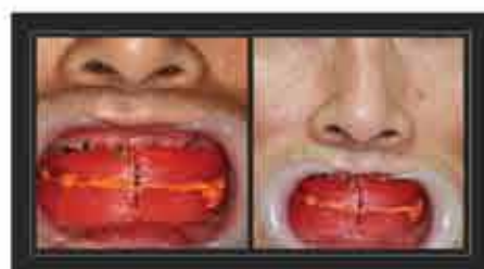
Figure 1. Acquisition of jaw relationship and vertical dimension for the prosthetic restoration of maxillary and mandibular implants using wax rims fabricated after impression taking.

In this case, the inner and outer surfaces of