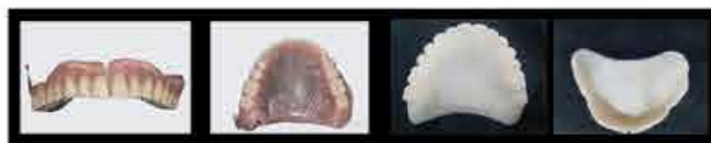
Figures 7-8. The previously used maxillary complete denture required duplication due to a fracture. The patient's complete denture was scanned using the Medit i700 then printed using a 3D printer.

In addition to the prosthetic restoration of implants, scanning dentures with intraoral scanners to duplicate existing dentures can reduce total treatment time and the number of visits.