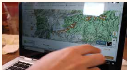
Waiting for the GPS pings to start again