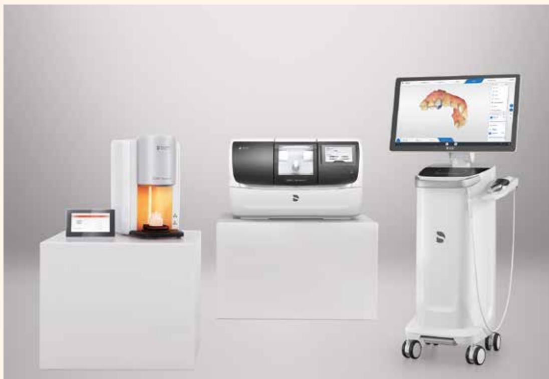
Fig. 3: The renewed CEREC system. CEREC Primemill proves to be a real gamechanger.

For more information on Primemill or CEREC please reach out to your local Dentsply Sirona representative or visit our website www.dentsplysirona.com