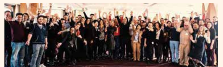
DTI held its 15th Annual Publishers' Meeting from 10-11 March in Cologne.

DTI's CE magazine archive grew to include 50 different titles during the year. CAD/CAM – international magazine of dental laboratories evolved into a magazine dedicated to dental laboratories, and the title digital – international magazine of digital dentistry will focus specifically on the topic of digital dentistry next year.