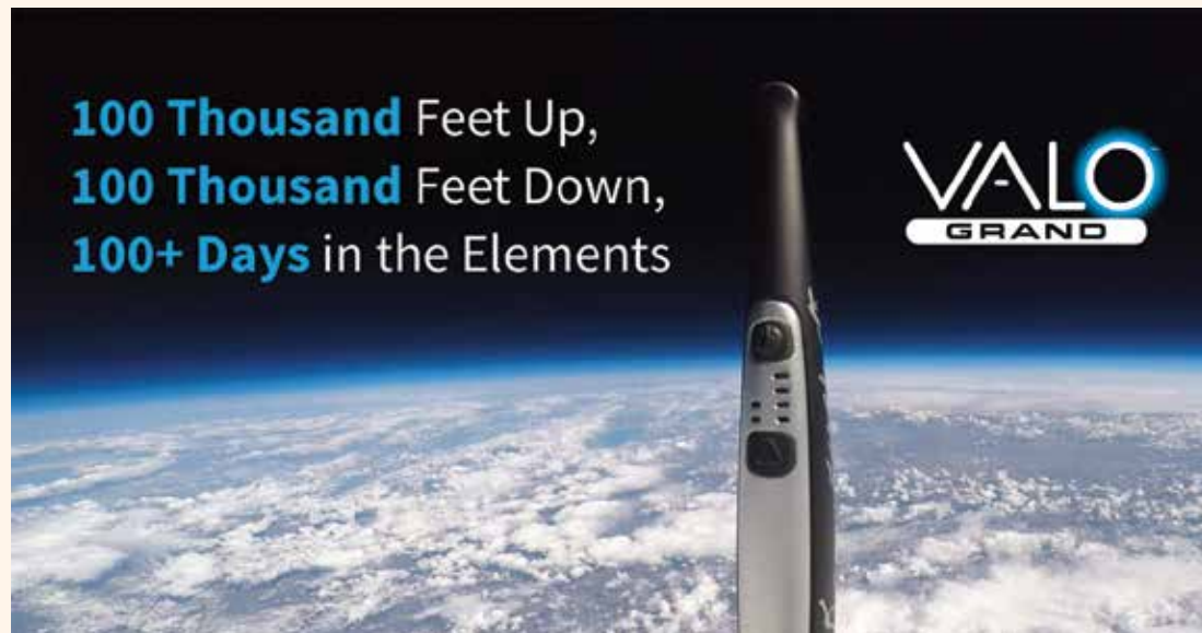
Logo and title excluded, the above is a non-doctored image of a VALO Grand curing light as it ascends through Earth's atmosphere.