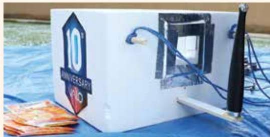
The VALO Light to Space payload box, prior to launch