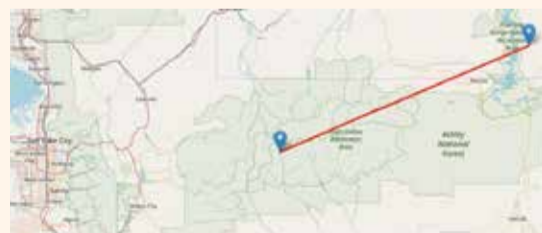
The point on the left marks where the payload landed, roughly 70 miles from the anticipated landing spot of Flaming Gorge Reservoir.