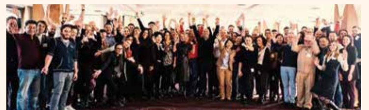
DTI held its 15th Annual Publishers' Meeting from 10-11 March in Cologne.

DTI's CE magazine archive grew to include 50 different titles during the year. CAD/CAM – international magazine of dental laboratories evolved into a magazine dedicated to dental laboratories, and the title digital – international magazine of digital dentistry will focus specifically on the topic of digital dentistry next year.