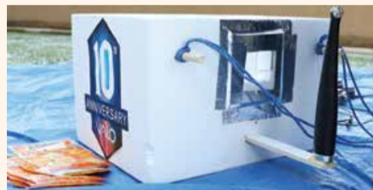
The VALO Light to Space payload box, prior to launch