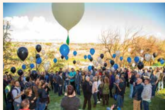
Moments prior to liftoff on Ultradent's lawn