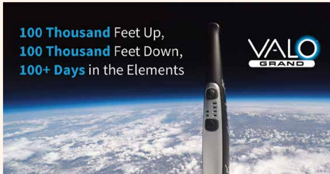
Logo and title excluded, the above is a non-doctored image of a VALO Grand curing light as it ascends through Earth's atmosphere.