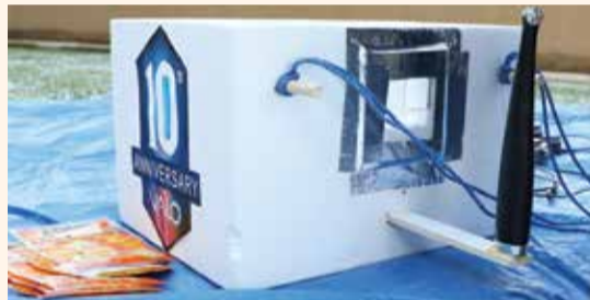
The VALO Light to Space payload box, prior to launch