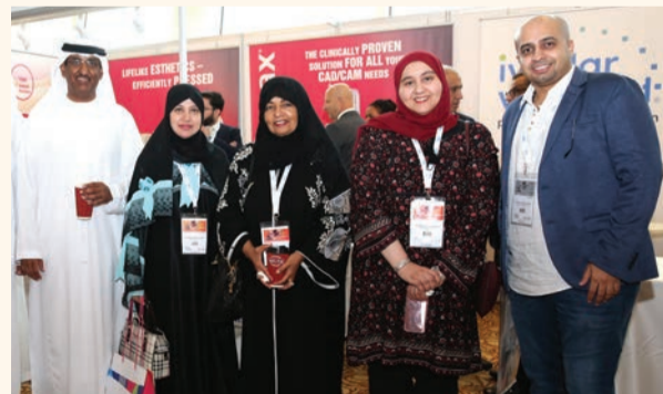
Delegates from Ministry of Health and Emirates Dental Society