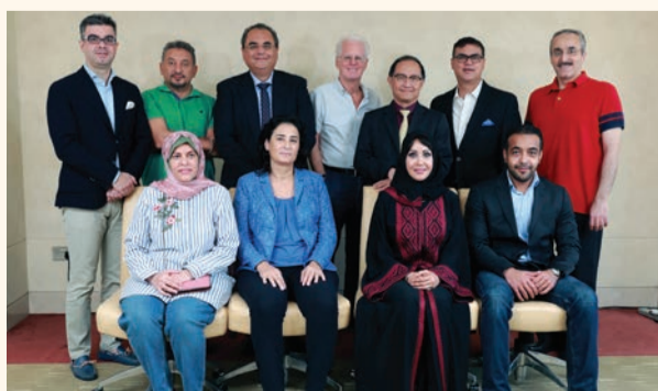
Dental Toothpaste Consensus 2017

"Thank you again for inviting me to this great meeting, it was a real honor to be part of this well organised event."