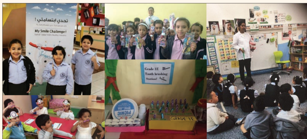
“MY SMILE” program was introduced to 12 government and private schools in Dubai, UAE