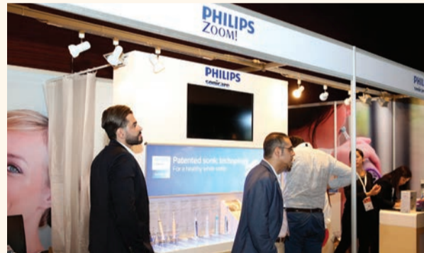
Gold Sponsor Philips presented once again Philips Sonicare and Zoom as part of its portfolio