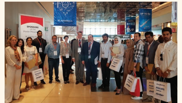
Poster Presentations at the 9th Dental Facial Cosmetic Conference