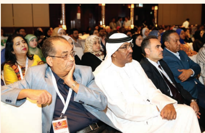
The event once again established itself as the region's largest scientific dental conference