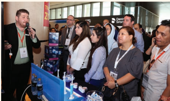
Free training zones at the Oral-B booth