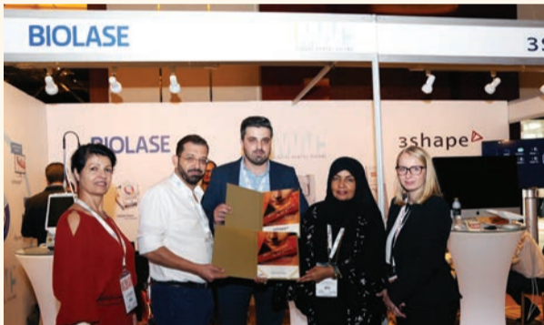
Gold Sponsor MAC Digital & 3Shape