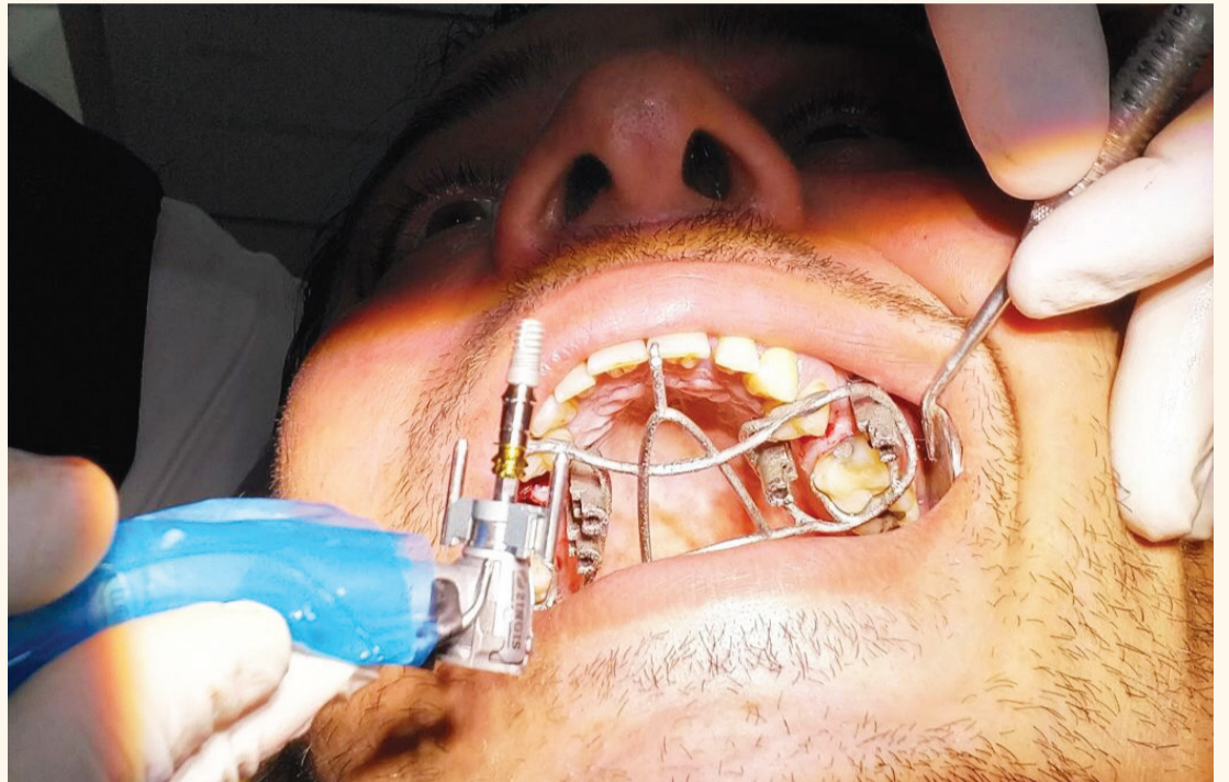
The open design of the guide gives great visibility and allows cooling

Our primary product line remains PFM crowns and bridges. However, since we last met, we have introduced two new products: Removable Partial Dentures and Metal Surgical Guides. The RPDs which we produce are a great solution for a partially edentulous patient who is not a candidate clinically or financially for implants. We use a metallurgical process called Solution Annealing which brings flexibility into our metal and helps with the fit for the patient. The second product is a metal 3D printed Surgical Guide. This is a really exciting innovation in Surgical Guides and we recently collaborated on a trial surgery to test the product in the Middle East region for the first time.