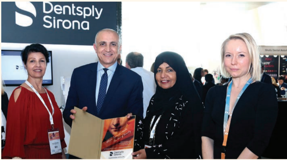
Platinum Sponsor Dentsply Sirona received appreciation for the continuous support