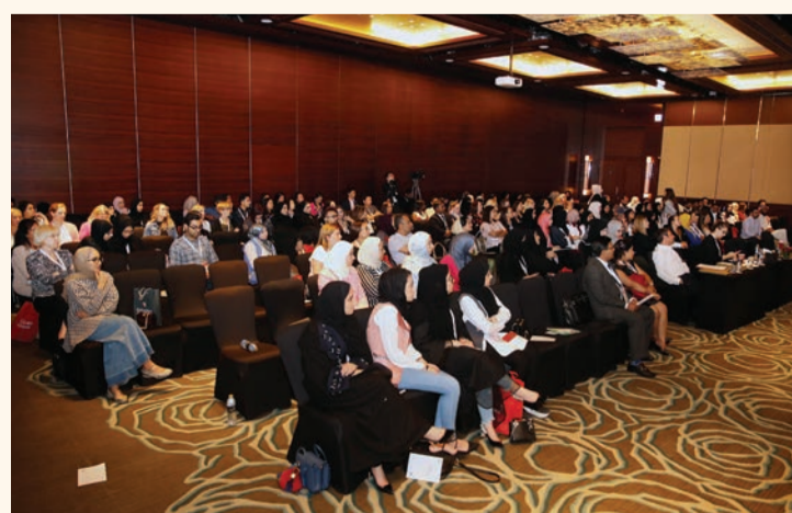
In total 303 dental hygienists were educated during the Dental Hygienist Seminar