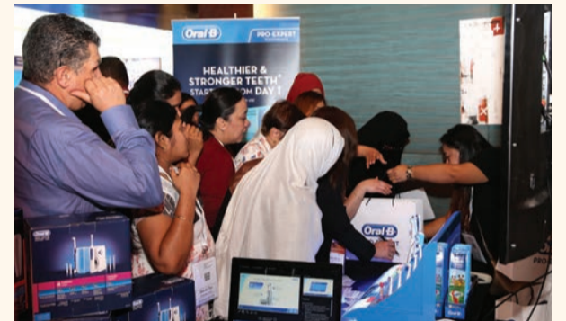
Gold Sponsor Oral-B held multiple Free CME trainings at its dedicated training zone