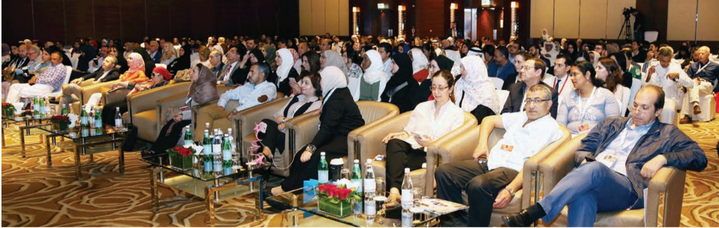
Over 3000 delegates attended the two day event 9th Dental Facial Cosmetic Conference & Exhibition