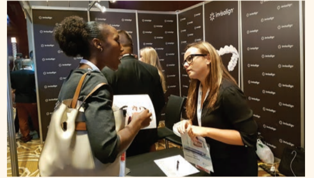
Gold Sponsor Invisalign was once again present this year