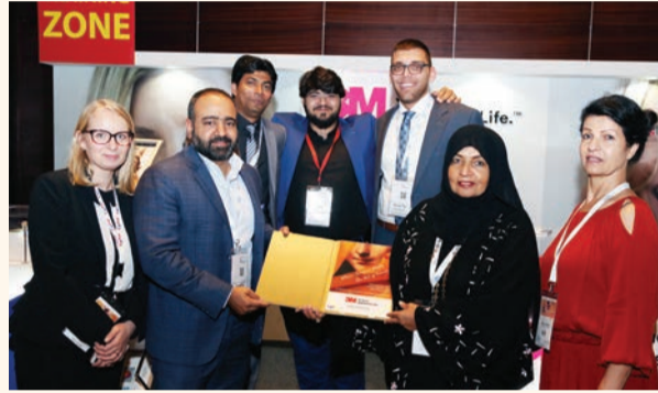
Gold Sponsor 3M received several dozens of delegates at their dedicated training zone at the booth