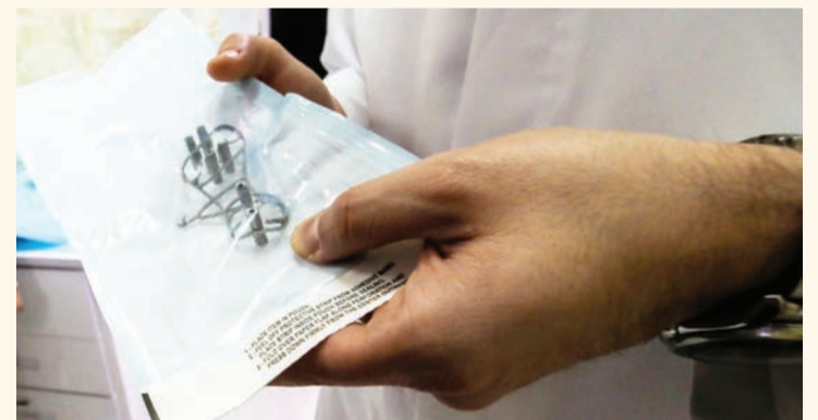
The metal 3D printed surgical guide which is sterilised before use