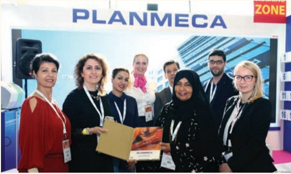
Gold Sponsor Planmeca presented their dream clinic at the exhibition