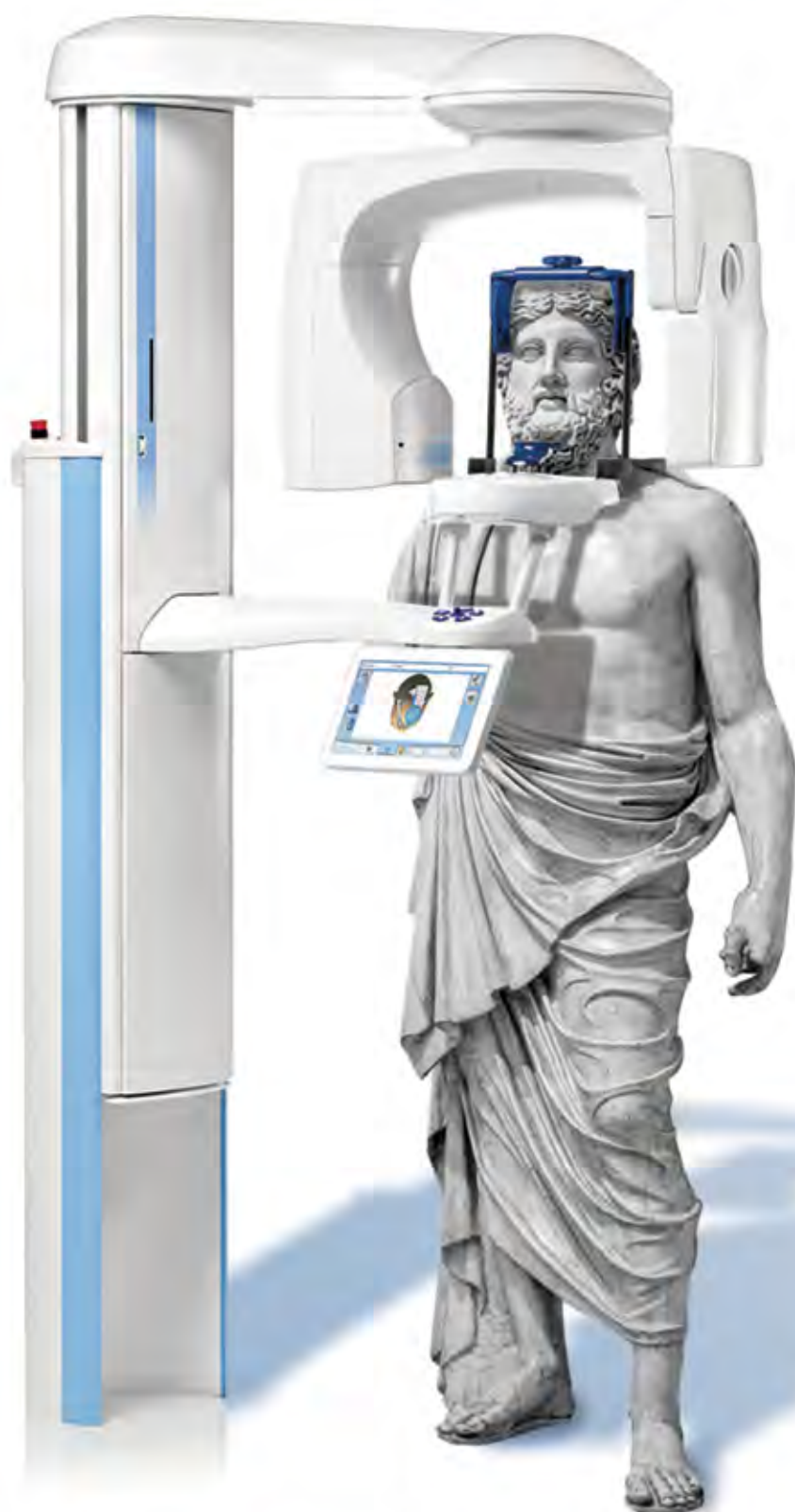
Without Planmeca CALM™