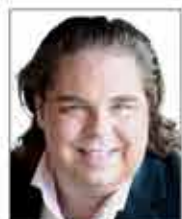
Dwayne Karateew, DDS Abutment Modification, Implant Provisionalization and Electrochemical Anodization of the Ti Alloy Abutment