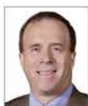
Michael S. Block, DMD A Practical Digital Workflow with CT Planning