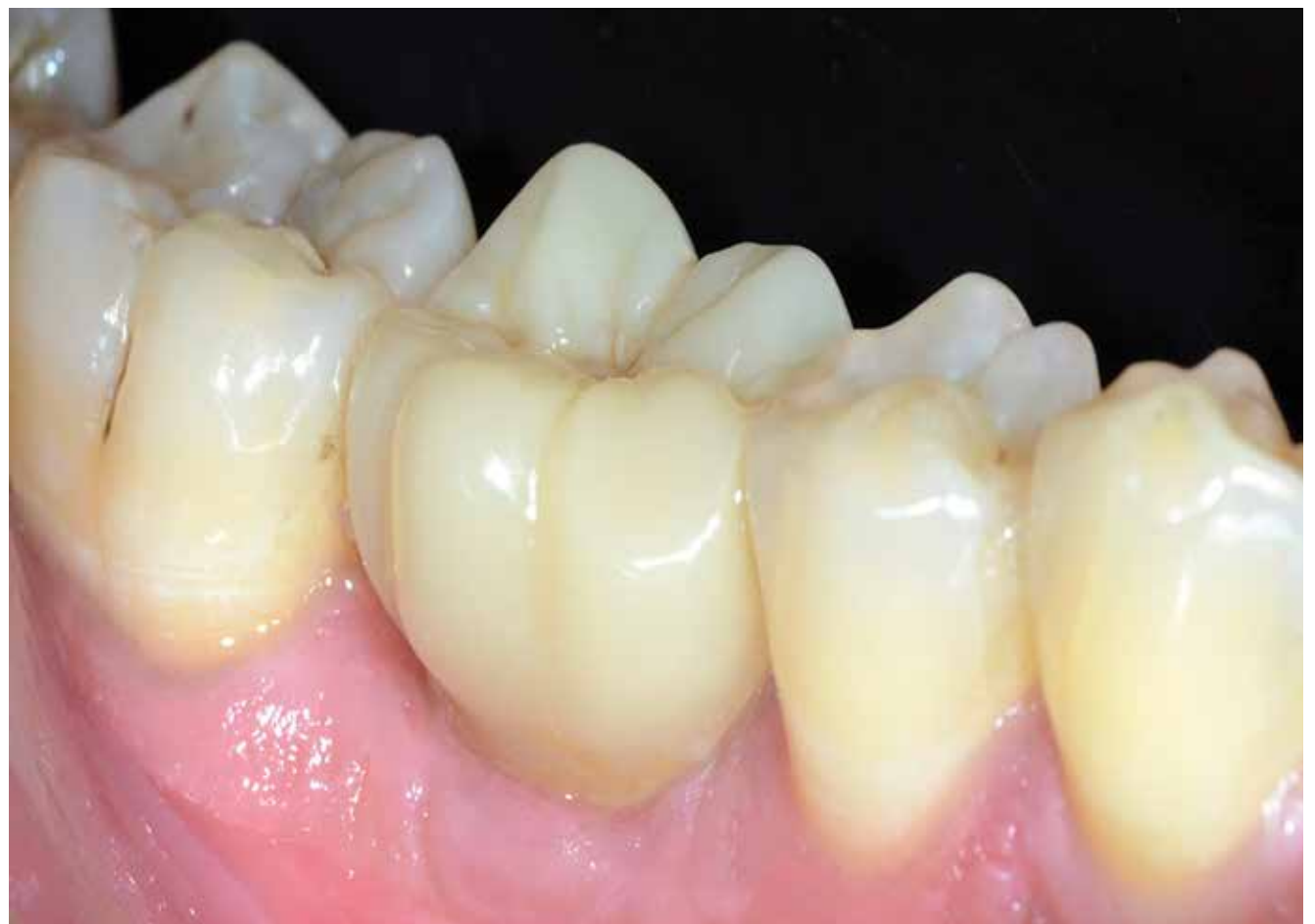
• Full-contour HC Block/Disk crown (Shofu) with a short implant (Bicon). Restoration was characterized with Lite Art Stains (Shofu).

with the capability of restoring teeth in one appointment, HC Block/Disk represents a generation of new CAD/CAM composites, according to Shofu, the company behind the product.