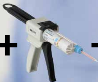
Temporize 3M™ Protemp™ 4 Temporization Material