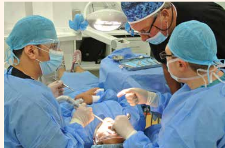
Implant surgery performed by the delegates on a patient supervised by Prof Göran Urde, Sweden during the CAPP Clinical Implantology Dentistry Certificate and Diploma programme

In 2020, CAPP will offer over 190 days of hands-on training courses across a broad spectrum of subjects. Classes vary in length from one-day seminars and short courses to long-term hands-on training courses in Restorative, Aesthetic, Endodontics, Implantology, Lasers and other