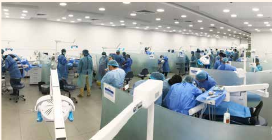
Implant surgery performed by 24 delegates on a real live patients during the CAPP Clinical Implantology Dentistry Certificate and Diploma programme

CAPPmea The Leader in Continuing Dental Education Onyx Tower 2 | Office P204 & P205 The Greens | Dubai | UAE P.O. Box: 450355 Tel: +971 4 347 6747 E-mail: events@cappmea.com