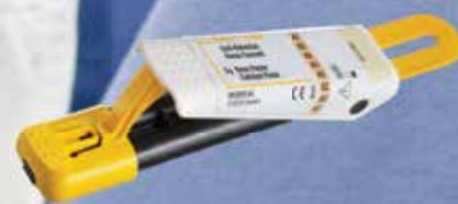
Cement 3M™ RelyX™ U200 Self-Adhesive Resin Cement