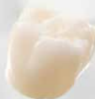
Restore 3M™ Lava™ Plus High Translucency Zirconia