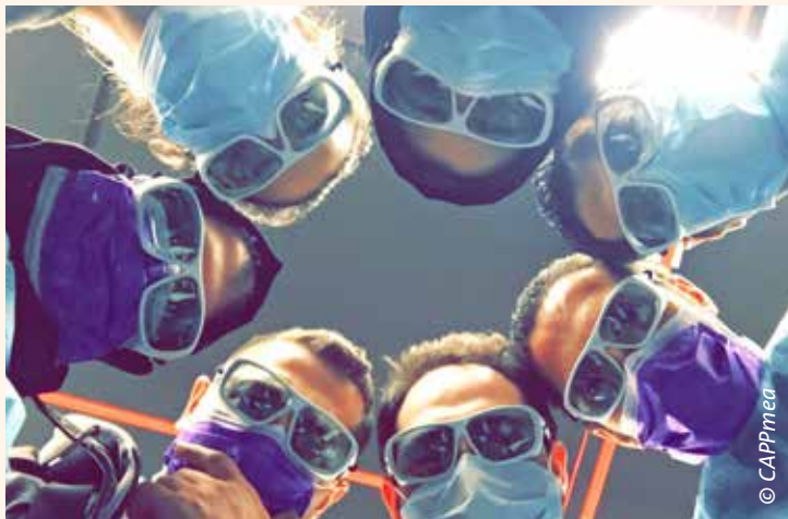
Delegates during the Erbium module of the CAPP, Aachen Dental Laser Center (AALZ) and RWTH International Academy - RWTH Aachen University

In order to increase the likelihood of reaching the targets of the local Middle Eastern Health Authorities in elevating oral health, Hu-Friedy and CAPP Training Institute engaged in an agreement in May 2019 where Hu-Friedy delivered almost 700 dental instruments to CAPP in order to support their