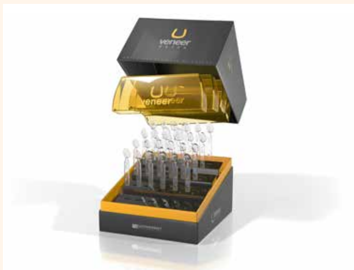
Uveneer Extra templates provide predictable, beautiful, and natural results through innovative designs.