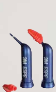
Retract 3M™ Astrigent Retraction Paste