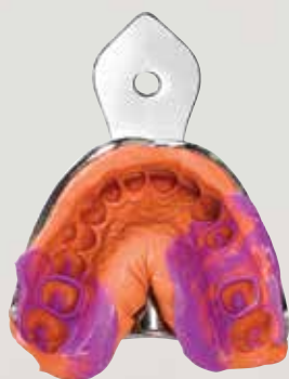
Impress 3M™ Express™ XT VPS Impression Materials