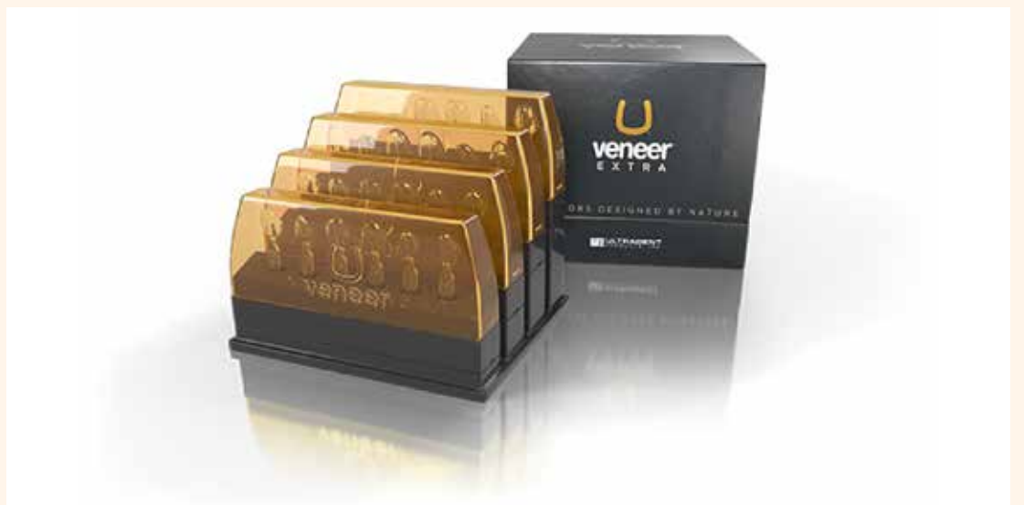
The Uveneer Extra template system mimics real tooth anatomy for authentic, natural results.