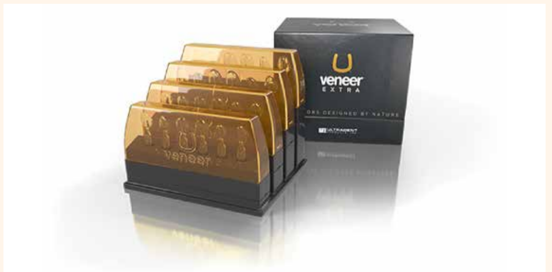
The Uveneer Extra template system mimics real tooth anatomy for authentic, natural results.