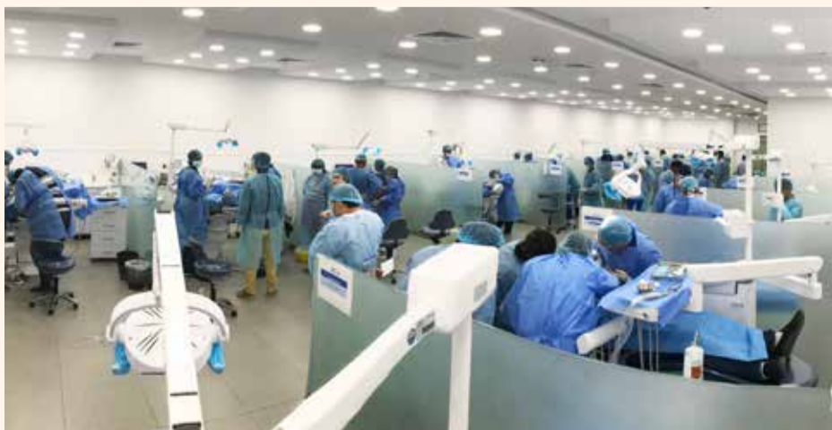
Implant surgery performed by 24 delegates on a real live patients during the CAPP Clinical Implantology Dentistry Certificate and Diploma programme

CAPPmea The Leader in Continuing Dental Education Onyx Tower 2 | Office P204 & P205 The Greens | Dubai | UAE P.O. Box: 450355 Tel: +971 4 347 6747 E-mail: events@cappmea.com