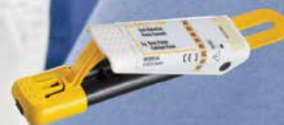
Cement 3M™ RelyX™ U200 Self-Adhesive Resin Cement