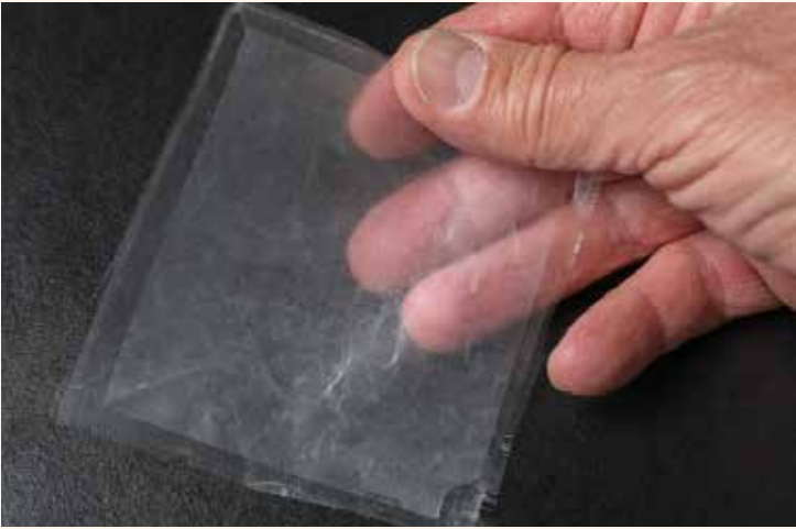
The polymer fibres of which the HelloMask is made produce an apparently transparent membrane but with pores too small for pathogens.

CHF 1 million fundraising round, the company is ready to move into the production phase.