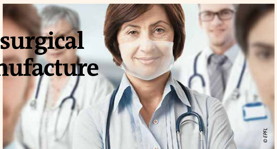
The transparent HelloMask facilitates non-verbal communication between patients and nursing staff.

now finalised the material, which is made of organic polymers, and recently founded the start-up company HMCARE. After completing a