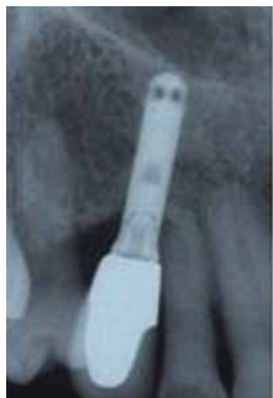
Fig. 2: Impingement on adjacent tooth.