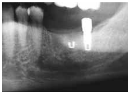
Fig. 1: Implant fracture.