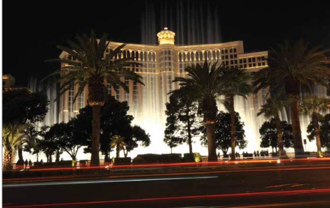
ICOI's Winter Symposium will take place at the Bellagio Hotel in Las Vegas from Feb. 10-12.