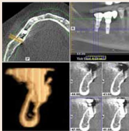
Fig. 3: Perforating the lingual undercut.

The author strongly believes that by taking a CBCT-, 3-D-based study prior to placing dental implants, many of the above mentioned complications can be circumvented. IT