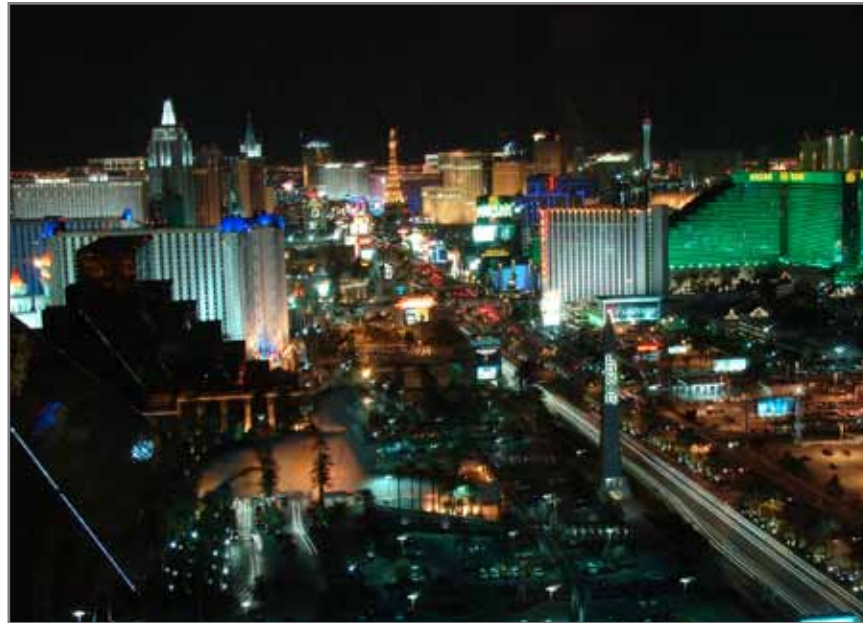
Get ready for bright lights and plenty of activity at the ICOI's Winter Symposium in Las Vegas.