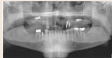
Fig. 5: Displaced implants into the maxillary sinus.

Dr. Almog's presentation, "Introduction to Cone Beam CT (CBCT), Especially as it Pertains to Prevention of Failures in Oral Implantology," from this year's DTSC Symposium at the GNYDM will be available for viewing online at www.DTStudyClub.com .