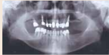
Fig. 4: Left sinus perforation.