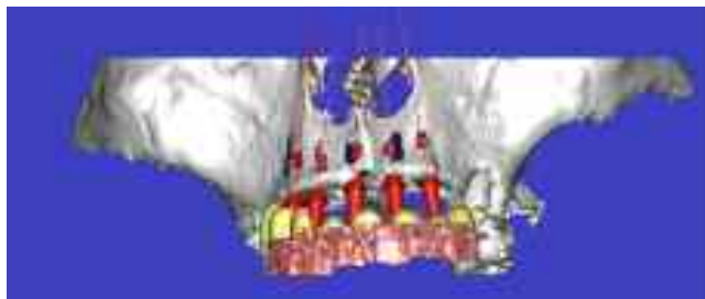
Fig. 6: SimPlant software.