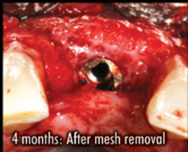
4 months: After mesh removal