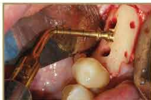
IMPLANT SITE PREPARATION