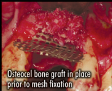
Osteocele bone graft in place prior to mesh fixation