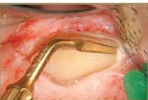
IMPACTED TOOTH EXTRACTION