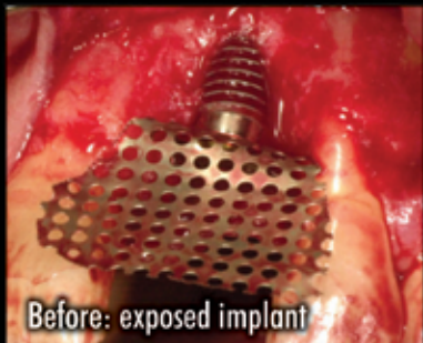
Before: exposed implant