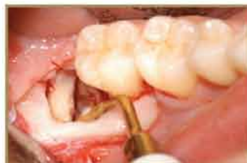
ATRAUMATIC TOOTH EXTRACTION