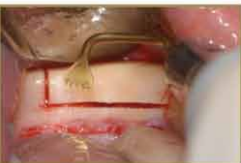
BONE BLOCK HARVESTING

12 Years Clinical Research | 30+ US & International Patents | 50+ Surgical Insert Tips | 75+ Published Articles & Studies