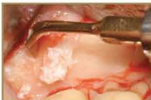
BONE CHIPS HARVESTING