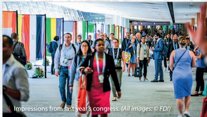
Impressions from last year's congress.

FDIWDC24 promises to be a landmark event, featuring over 150 sessions and offering a remarkable 144 continuing education credits. Dental professionals will have the opportunity to learn from leading experts and stay abreast of the latest technologies and advancements in dentistry. The event's comprehensive four-day scientific programme will be presented in parallel sessions across several halls, allowing attendees to immerse themselves in cutting-edge research, innovative