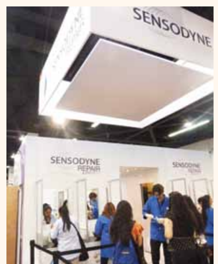
Attendees try out the new Sensodyne Repair and Protect toothpaste at the booth's brushing stations (No. 2120).