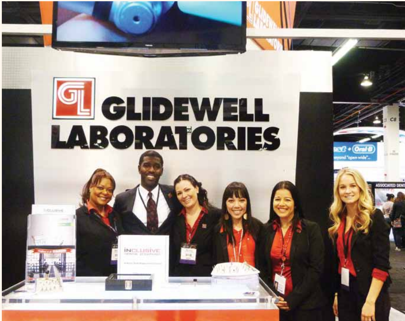
The Glidewell staff at booth No. 1348 stands ready to help.