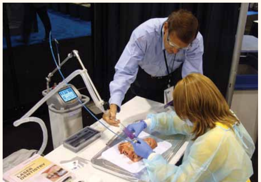
A participant receives training during a hands-on workshop in the Laser Pavilion on Thursday morning.

Check your meeting guide for locations and for additional educational options.