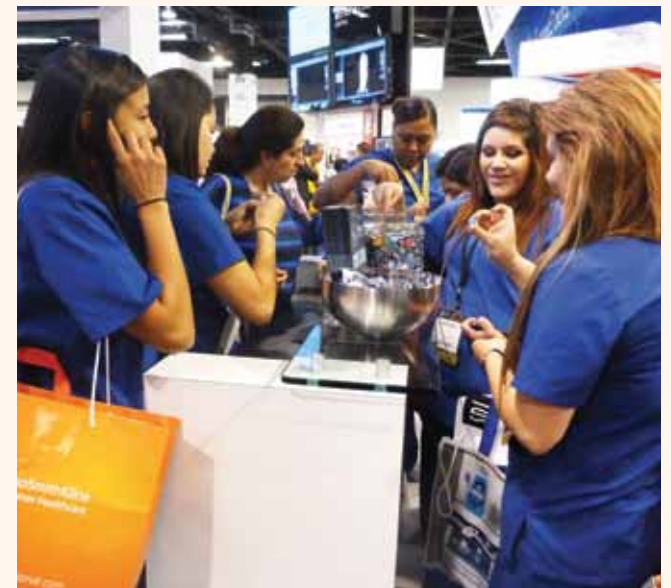
Dental students from Charter College in Long Beach admire the free dental buttons at the Henry Schein booth, No. 2424.