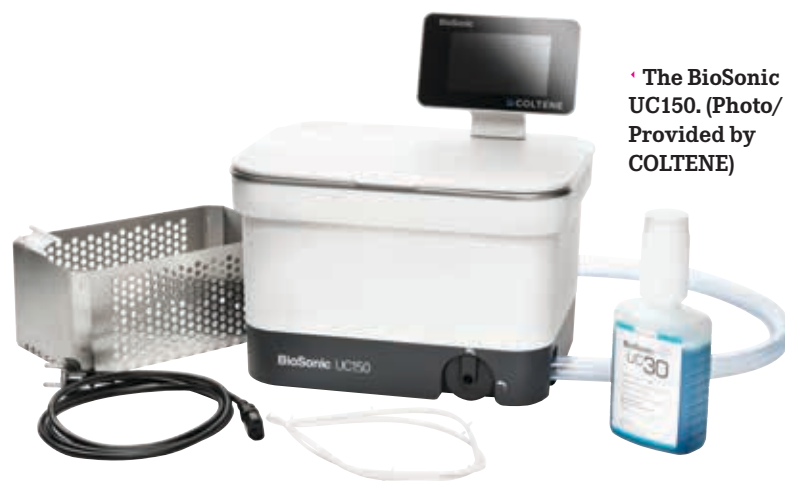
• The BioSonic UC150.

The unique plastic hinged lid minimizes noise and traps vapors, creating a quiet and comfortable working environment. The open/close detection feature encourages protocol compliance and ensures closed operation. The lid can also be used as a tray to air-dry instruments prior to bagging and autoclaving.