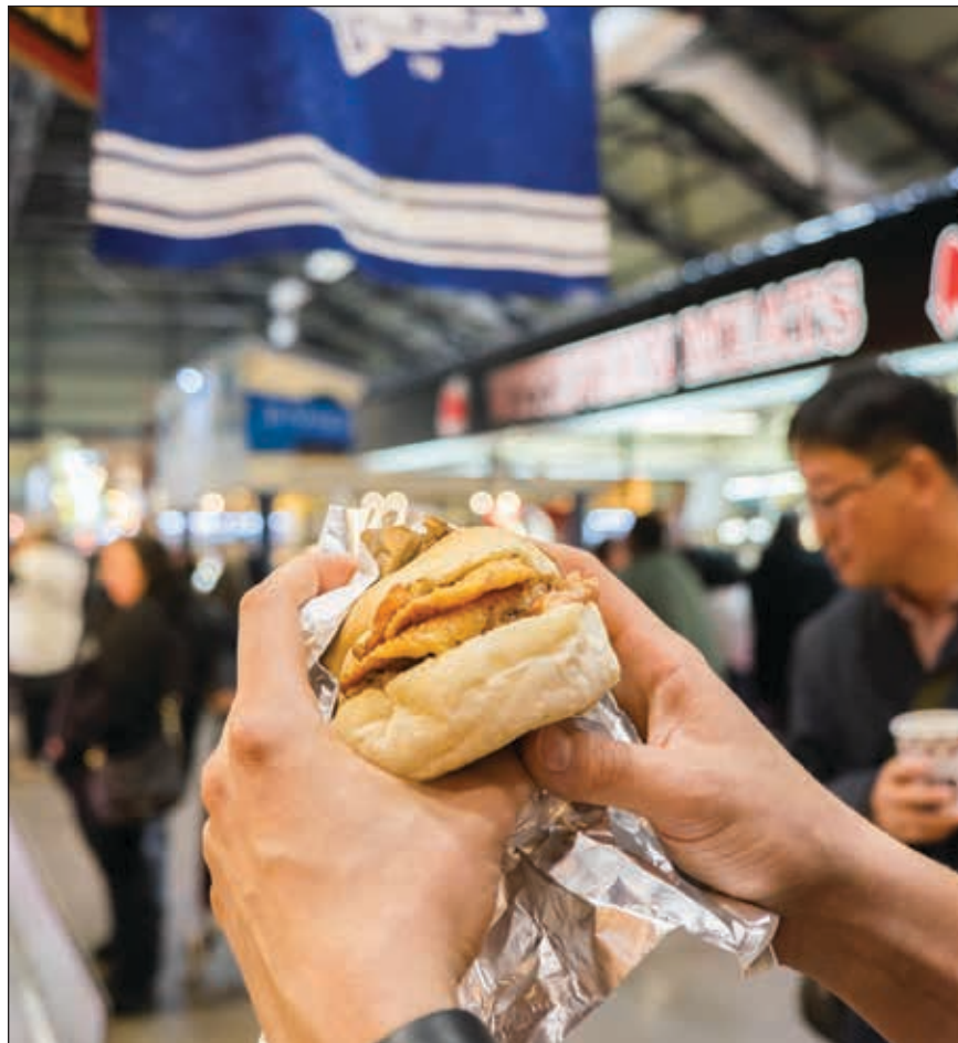
• Taste a peameal bacon sandwich (with honey mustard) and a butter tart at the 200-year-old St. Lawrence Market.