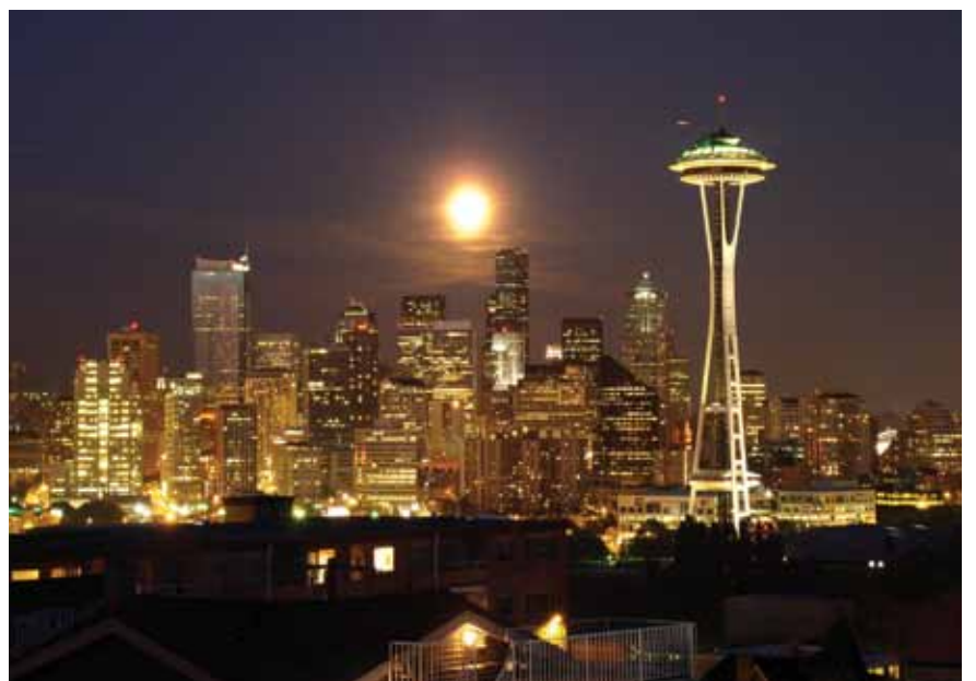
The skyline of Seattle.