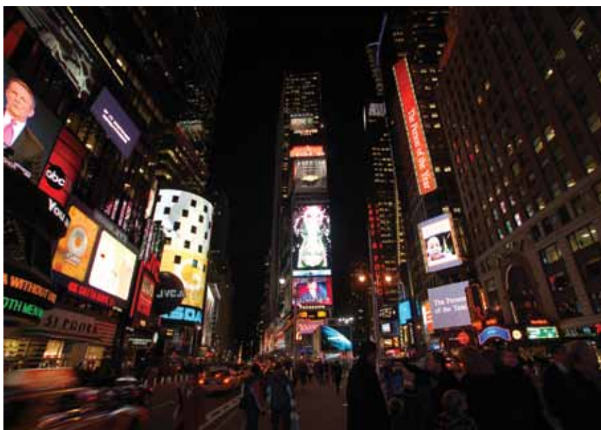
Times Square in New York.