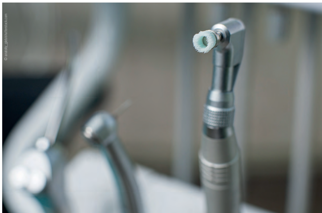
Market analysts have predicted that the changing health care sector will create lucrative opportunities in various segments of the dental industry, for example for equipment manufacturers.

"Indonesia is huge and up until now was never fully able to exploit the associated market potential."