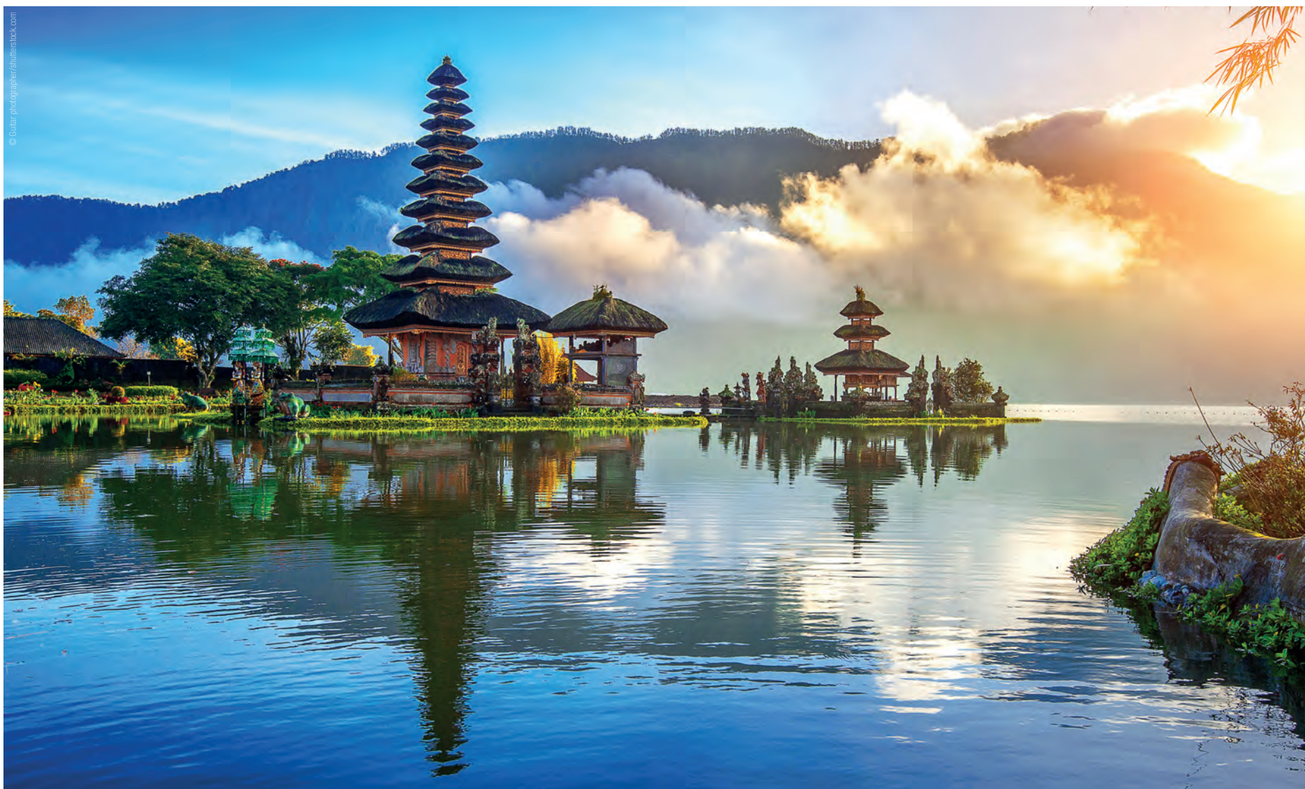
Beautiful Indonesia. Together with Mexico, Nigeria and Turkey, the South-East Asian country has been identified as one of the emerging economic giants of the future, termed "MINT" countries by British economist Dr Jim O'Neill.

■ Blessed with a diverse landscape and a rich cultural history, Indonesia is one of the most fascinating countries in Asia. And yet, although its natural treasures do not fall short of the attractions of nearby countries, the number of foreigners visiting Indonesia has remained considerably lower than Singapore or Malaysia. 1 Of course, the reasons for this are multifaceted. Nonetheless, Indonesia's weaker performance in the tourism industry is just one example of the country's immense potential that is evident in many areas, not least in its medical and dental care industries.