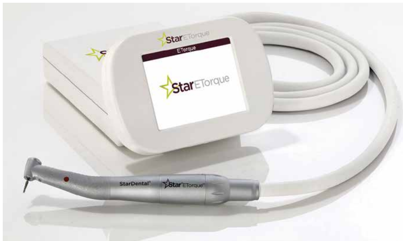
• The StarETorque customizable electric system.