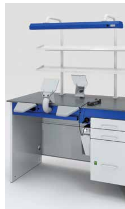
• The InOffice workstation.

DentalEZ Integrated Solutions is committed to providing real solutions to everyday challenges in oral health-care by uniquely combining innovation focused on simplification and efficiency in value-based products and outstanding customer service and