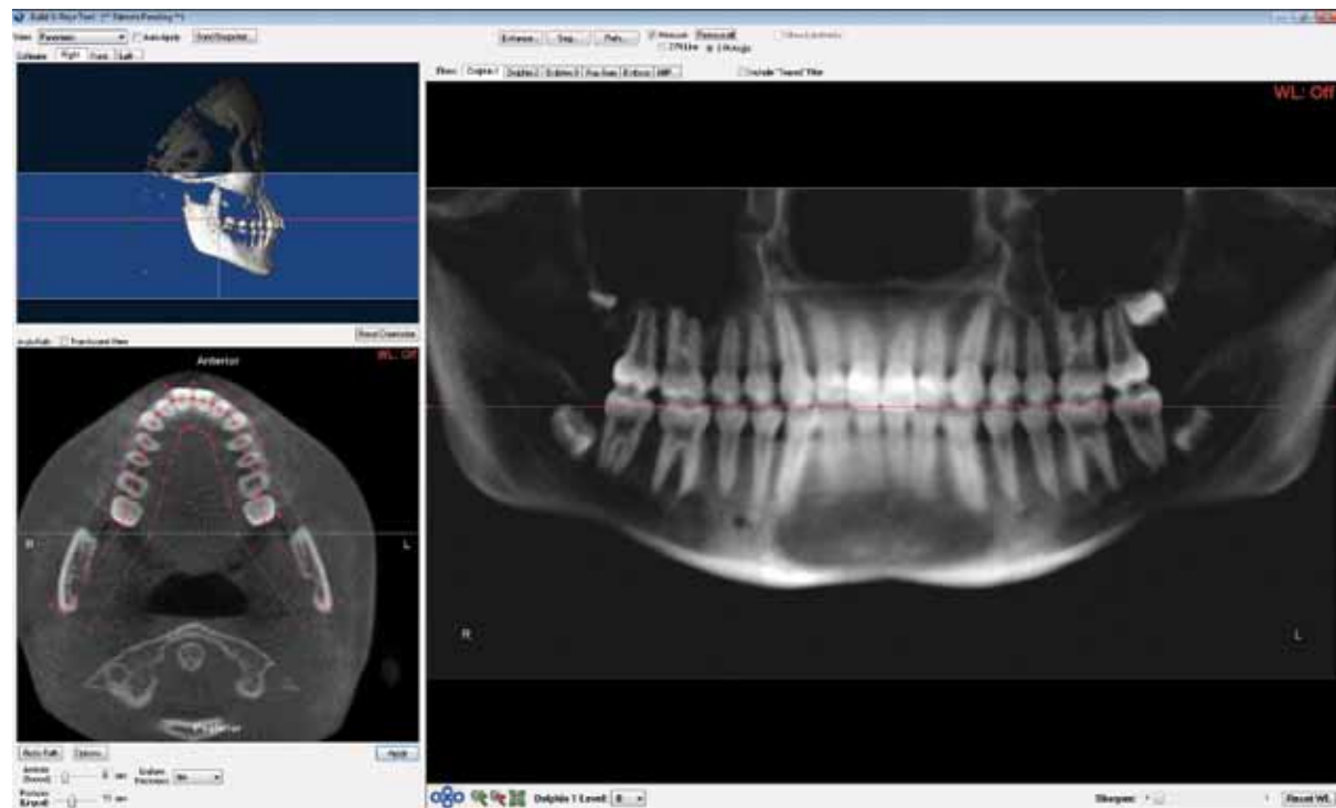
Fig. 1: Constructing a 2-D panoramic-like image from a 3-D CBCT patient scan.

However, the use of panoramic radiographs to check mesiodistal tooth angulation is fundamentally flawed primarily due to dimensional and angular distortions as a result of image layer (focal trough) discrepancy. Investigators have also attributed the inaccuracy of panoramic images to projection geometry, variable vertical and horizontal magnification factors and patient positioning errors (Bouwens, Cevitanes, Ludlow and Phillips, 2011). Part of the reason why traditional panoramic radiographs are inaccurate in capturing the angulations