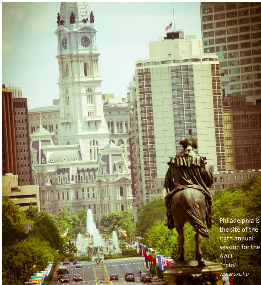
Philadelphia is the site of the 113th annual session for the AAO.