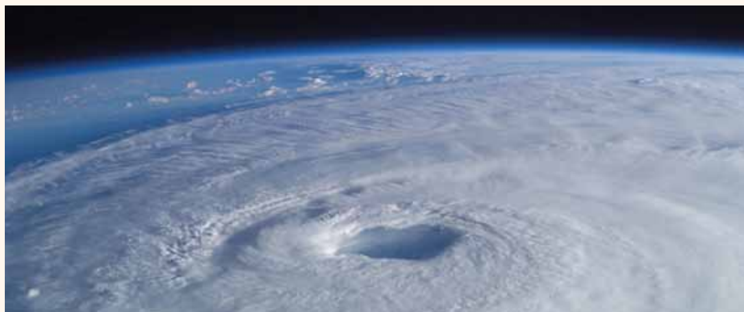
Finally, courtesy of the Dental Tribune U.S. editor in chief, an explanation for all the recent hurricanes.

Was that a placard seen at the annual endodontics meeting stating, "Use the strongest dose of peroxide twice a day