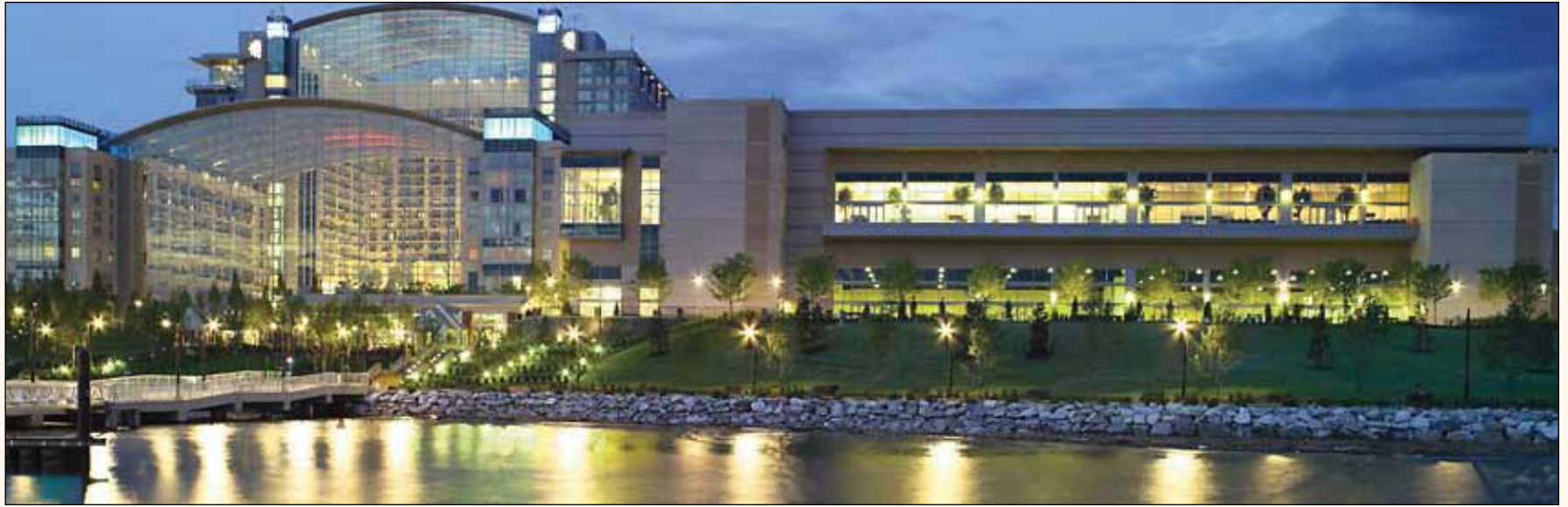
The Gaylord National Resort and Convention Center in National Harbor, Md., hosts the National Dental Association's centennial annual meeting from July 26–30.