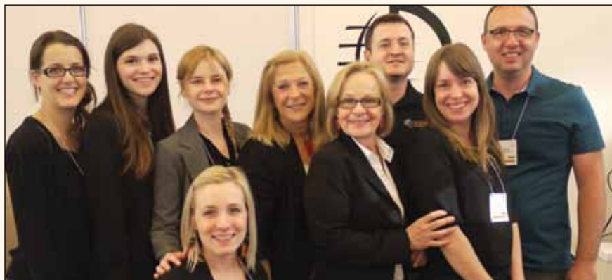
The JDIQ registration staff, pictured here at the 2013 meeting, is always ready to help. The 2014 JDIQ runs from May 23–27.