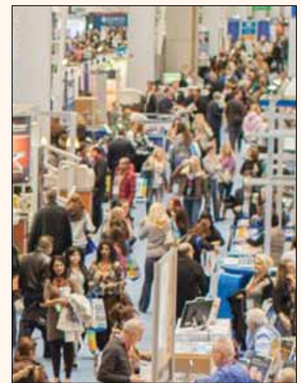
One of North America's biggest dental meetings, Yankee Dental Congress attracts nearly 30,000 attendees, keeping the 2013 exhibit hall active.

• Master the Skills of Marketing Your Practice in One Day — A one-day symposium designed to help expand your practice with the power of marketing. Courses include “High Energy Marketing to Explode Your New Patient Numbers,” “Secrets of Social Media Success and Online Marketing,” “Get Noticed, Get Booked, and Grow Your Practice” and “Best Practices for Leveraging So-