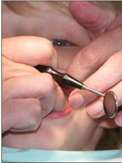
The Pew Charitable Trusts Children's Dental Campaign continues to push for expansion of the dental workforce. It supports creation of trained 'dental hygiene therapists' — midlevel-care providers who could perform procedures now under taken by only dentists in most states.