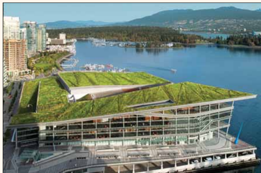
The Vancouver Convention Centre, its ‘green’ roof clearly visible, is the host site of the 2014 Pacific Dental Conference.