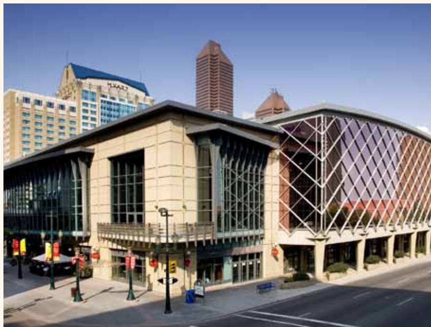
Host facility of the 2013 International Association of Comprehensive Aesthetics Conference, the Telus Convention Centre, is located in the heart of downtown Calgary within easy walking distance of a variety of shopping, dining and entertainment.