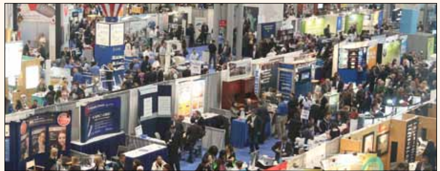
Unchanged: free registration. But new at the 2013 Greater New York Dental Meeting are three hands-on pavilions with lasers, CAD/CAM and cone-beam/CT/X-rays.

The GNYDM continues to offer a modern, high-tech free “live dentistry” arena daily from Sunday through Wednesday.