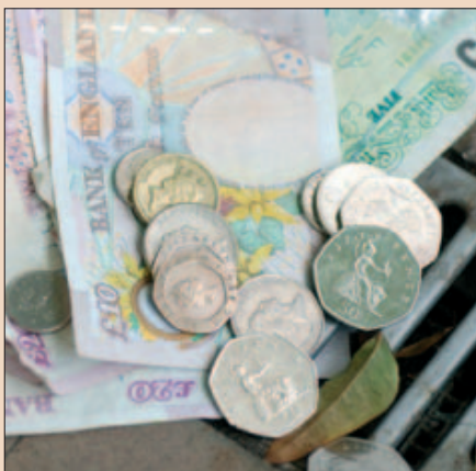
Money to waste in Cornwall

This is now factored in to the dental strategy and is presently being developed.