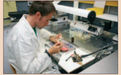
Using titanium is a breakthrough for dentistry

Staff at the hospital hope to develop the technique for the production of crowns and bridges, but it could also be used in the production of dentures for patients with missing teeth. DT