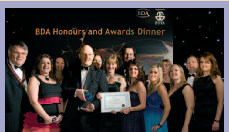
The Priors Dental Practice celebrates after winning the BDA's Good Practice Scheme award.