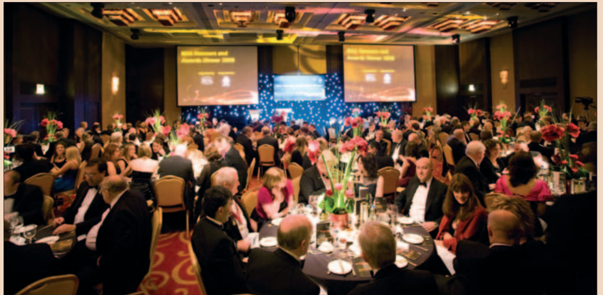
Guests celebrated in real style at the BDA Honours and Awards Dinner