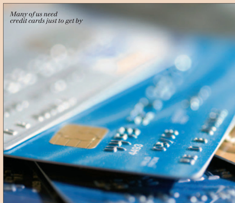
Many of us need credit cards just to get by