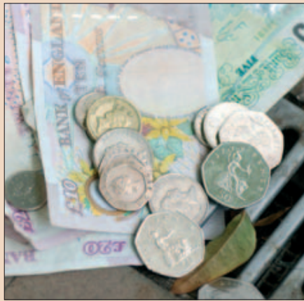
Money to waste in Cornwall

This is now factored in to the dental strategy and is presently being developed.