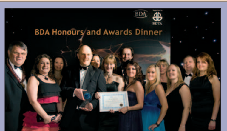
The Priors Dental Practice celebrates after winning the BDA's Good Practice Scheme award.