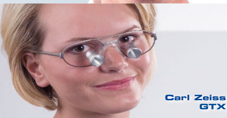
Carl Zeiss GTX