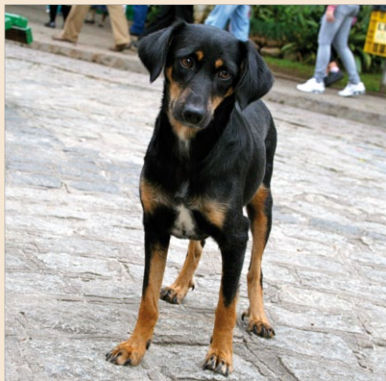
Giving dogs braces came in at the top of the weird requests

The survey was conducted for the Chicago Dental Society’s 146th annual Midwinter Meeting, which brought more than 30,000 dental professionals to Chicago this February 24-26. The Midwinter Meeting is a forum for dentists to learn about new products, technologies, and methods. DT