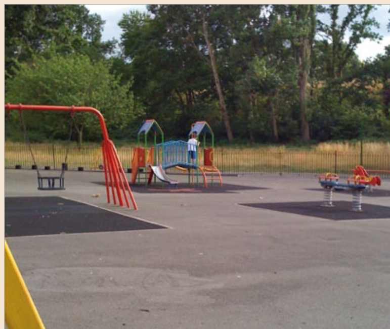
Playgrounds and all NHS grounds could be made smoke free

According to reports, the current consultation claims that smoking is the largest single preventable cause of ill health and premature death in Wales, causing around 5,650 deaths each year. DT