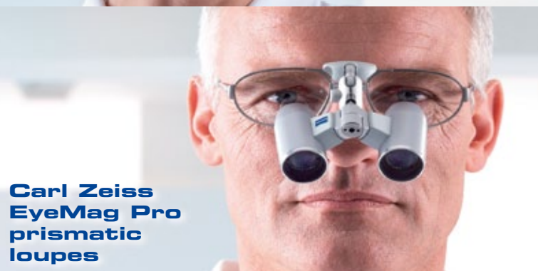
Carl Zeiss EyeMag Pro prismatic loupes