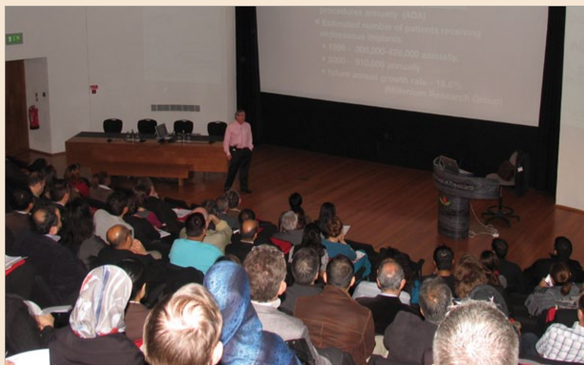
A packed lecture from CIC 2010

For early bird offers, or to book, call Jamie on 0207 400 8989 or visit www.clinicalinnovations.co.uk DT