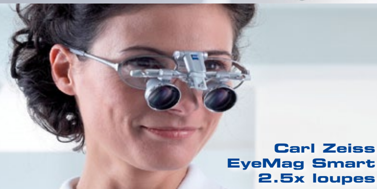
Carl Zeiss EyeMag Smart 2.5x loupes