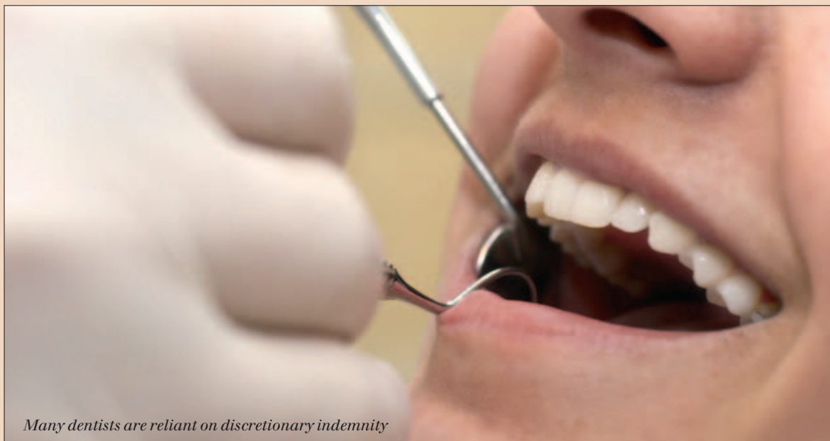
Many dentists are reliant on discretionary indemnity