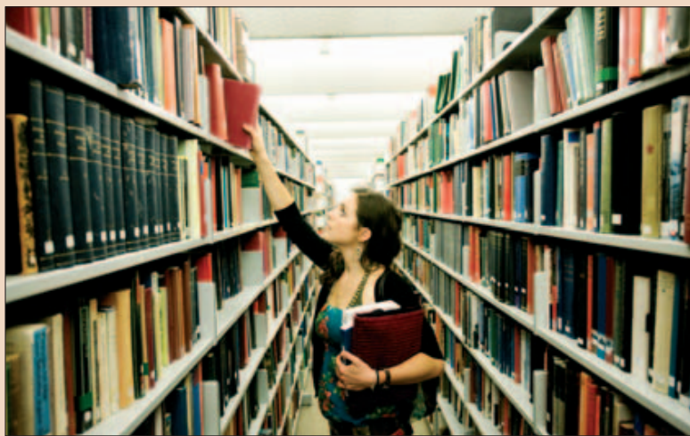
The guidance will steer students towards a greater awareness of the professionalism

The General Dental Council is holding a consultation on the draft guidance regarding Student Fitness to Practise.