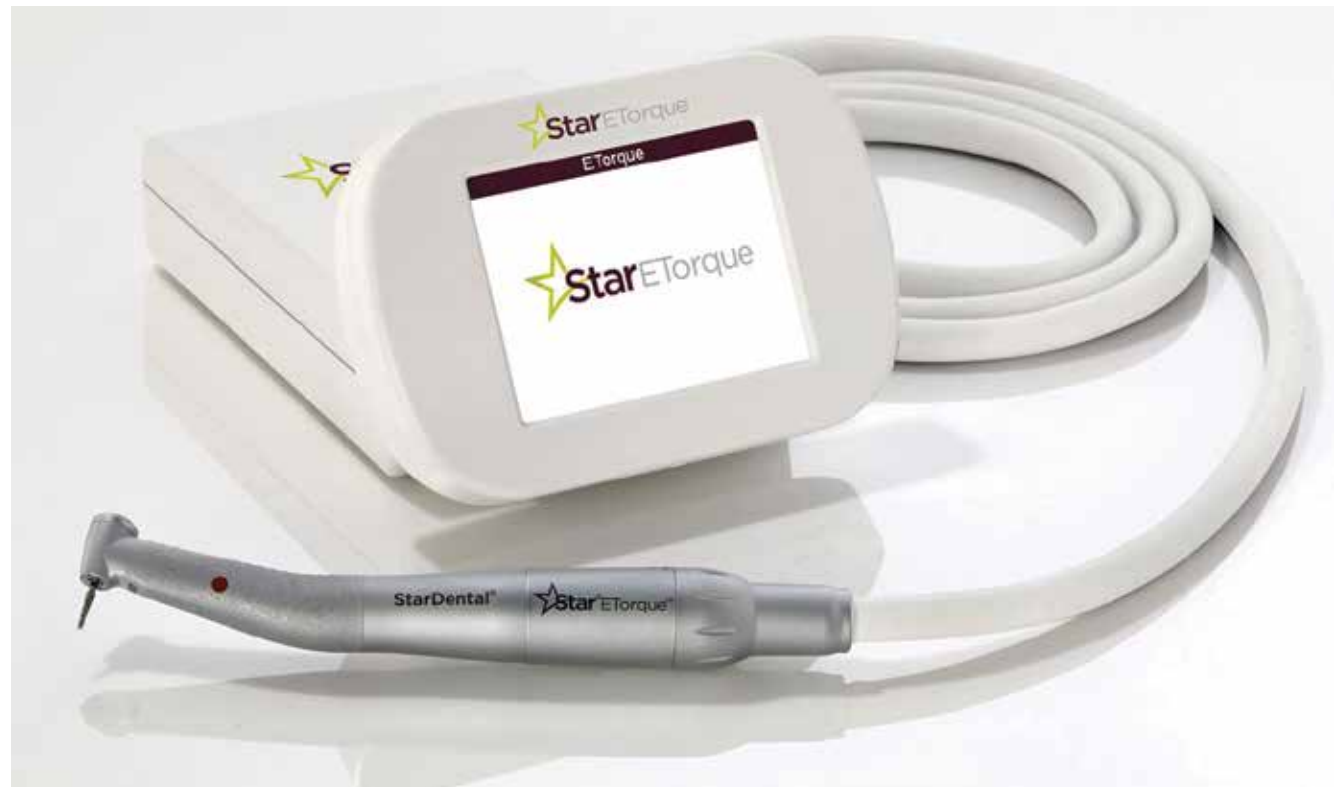
• The StarETorque customizable electric system.