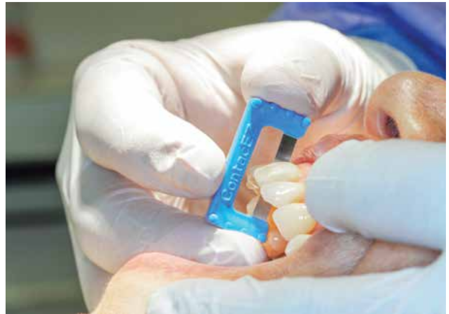
• The ContacEZ Restorative Strip System.