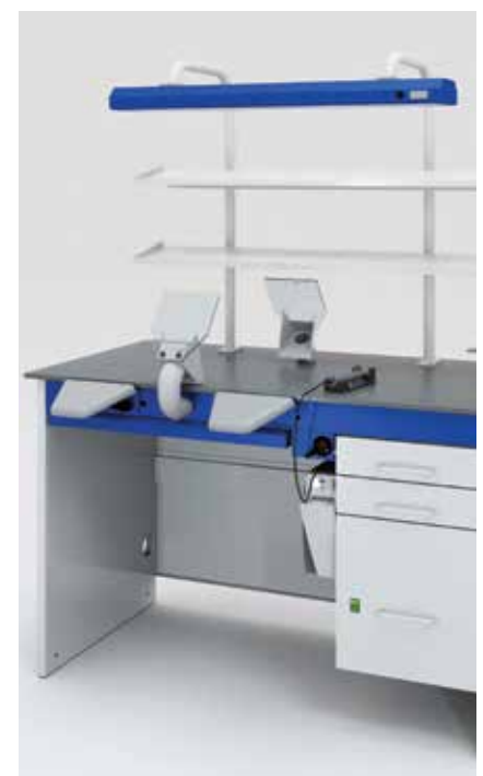
• The InOffice workstation.

DentalEZ Integrated Solutions is committed to providing real solutions to everyday challenges in oral health-care by uniquely combining innovation focused on simplification and efficiency in value-based products and outstanding customer service and